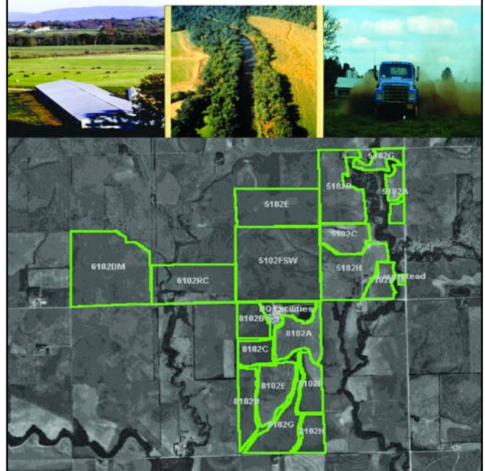
Figure 1. Farming operations that utilize animal manure such as poultry litter as fertilizer for forages should obtain a nutrient management plan to guide their practices.

Modern agricultural production relies on the addition of plant nutrients to cropland to ensure profitable production. Applying excessive nutrients beyond crop needs can reduce production efficiency as well as increase the potential for unfavorable impacts on surface and groundwater quality. Developing management strategies to determine fertilizer applications to best meet crop needs can be challenging. This is especially true when using animal manure as a fertilizer source (Figure 1).