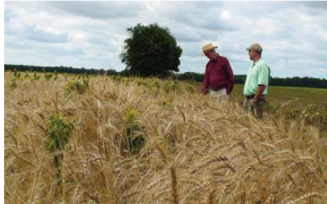
Figure 1. County Extension agents can assist landowners with establishing conservation plantings which benefit wildlife.