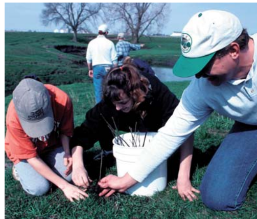
Figure 3. Bundles of tree seedlings can be purchased for a nominal cost from the Arkansas Forestry Commission.

Tree Seedling Program. The Arkansas Forestry Commission owns and operates a tree improvement complex and a tree seedling nursery for production of pine and hardwood seedlings (Figure 3) for sale to private landowners. Seedling price list and order forms may be obtained at any Forestry Commission office or online, or seedlings can be purchased online at www.forestry.state.ar.us . Purchase seedlings early (i.e., July) as supplies are limited. Contact the Arkansas Forestry Commission (501-296-1940 or http://www.forestry.state.ar.us/ ).