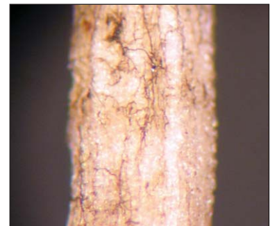
Figure 2. Ectotrophic runner hyphae of Gaeumannomyces graminis var. graminis on a zoysiagrass root