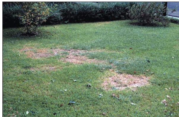
Figure 1. Irregular declining areas of take-all root rot

Visit our web site at: https://www.uaex.uada.edu