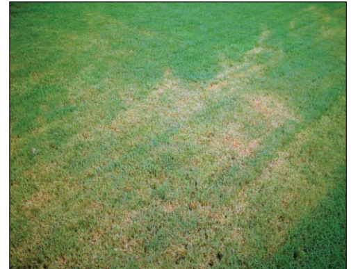
Figure 1. Thin and yellow rust-infected turf areas

In Arkansas, symptoms usually become visible in mid to late summer. The early symptoms of rust infection will often appear as irregular light-yellow colored areas ( Figure 1 ). Infections usually begin in shady, wet locations or anywhere the lawn may be stressed. Walking through infected areas will often leave an orange-brown dusting on your shoes. Close examination of individual yellowed leaves will show the presence of raised brick red to yellow-orange colored “pimples” or pustules that are scattered over the leaf surface ( Figure 2 ). These pustules contain very small spores that can become wind-borne and are responsible for spreading the fungus to other locations. Rust pustules usually appear on the leaves first and then spread to the stems. When infection is severe, these powdery spore masses can easily rub off on shoes or fingers, giving them a brown, dusty color. Heavily infected lawns will often develop thin areas, and death of the grass is possible during severe infections. These affected areas are more susceptible to winter damage. Symptoms tend to be especially visible during drought stress conditions or when grass is growing slowly.