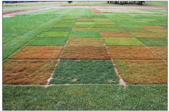
Figure 3. Difference in rust susceptibility among Kentucky bluegrasses

Management efforts should focus on both cultural and chemical methods. The most important cultural control is to select species and cultivars with good resistance to rust pathogens ( Figure 3 ). Typically, rusts are less of a problem on tall fescue ( Festuca arundinacea ), bermudagrass ( Cynodon spp.) and zoysiagrass ( Zoysia spp.) turfs. Kentucky bluegrass and perennial ryegrass are more susceptible to rusts in Arkansas. When planting a cool-season lawn, make sure not to use more than 10 percent perennial ryegrass ( Lolium perenne ), 10 percent Kentucky bluegrass ( Poa pratensis ) or 10 percent hybrid bluegrass in a mixture with tall fescue. Additionally, it is important to select cultivars with low susceptibility to rust pathogens ( Table 1 ) if the intended area is low maintenance or you anticipate using a reduced nitrogen fertility program.