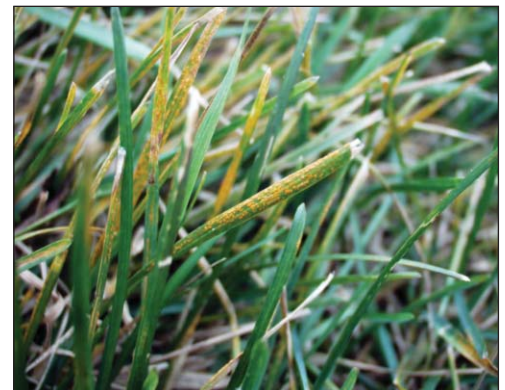
Figure 2. Rust pustules on leaves