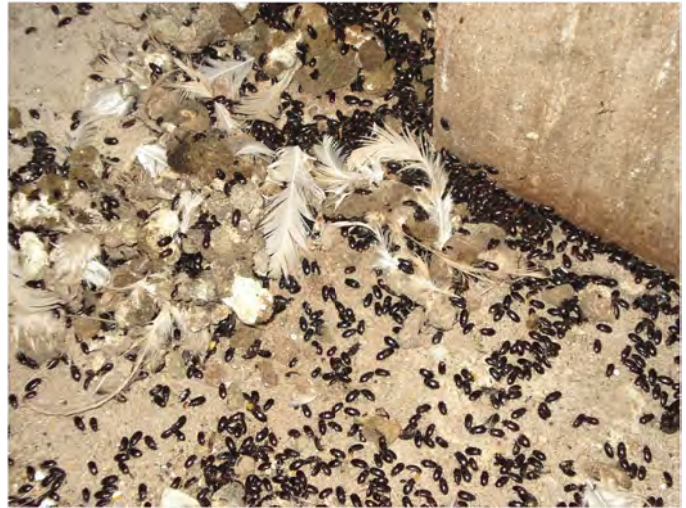
Figure 4. Lesser mealworm adults in a poultry facility.

collected). By monitoring weekly or twice monthly with this trap, producers can detect a rapid increase in numbers or a change in the stage structure of the population. Other monitoring methods include use of “sentinel” insulation boards placed on walls or posts for routine monitoring of larval entry holes. Simple counting of lesser mealworm during the evening can also provide an indication of the population (Figure 4).