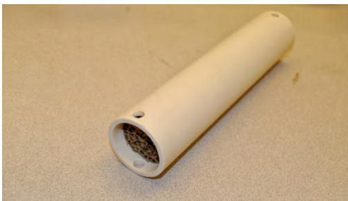
Figure 3a. Tube trap used to monitor lesser mealworms.

Routine Surveillance – Monitoring lesser mealworm infestations in poultry facilities is an asset to the overall management program by alerting producers of a rapid rise in numbers or to determine if control measures were effective following a treatment. One method routinely used in studies to evaluate the efficacy of insecticides is the tube trap (Figures 3a and 3b). This trap is simply a 10-inch (254 mm) piece of 1 1/2 I.D. (38 mm) schedule 40 PVC pipe with a hole drilled on each end (to stake the pipe to the floor to prevent movement by birds). Corrugated cardboard is rolled up and placed inside the pipe. A few traps will be staked to the litter floor for about one week then removed. The corrugated cardboard is removed from the PVC, and adults, larvae and pupae are counted. Keep track of the number of adults, larvae and pupae (usually very few pupae are