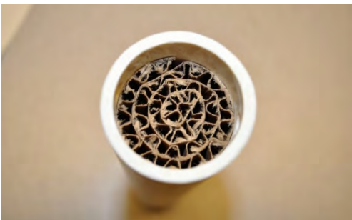
Figure 3b. End view of tube trap used to monitor lesser mealworms.

collected). By monitoring weekly or twice monthly with this trap, producers can detect a rapid increase in numbers or a change in the stage structure of the population. Other monitoring methods include use of “sentinel” insulation boards placed on walls or posts for routine monitoring of larval entry holes. Simple counting of lesser mealworm during the evening can also provide an indication of the population (Figure 4).