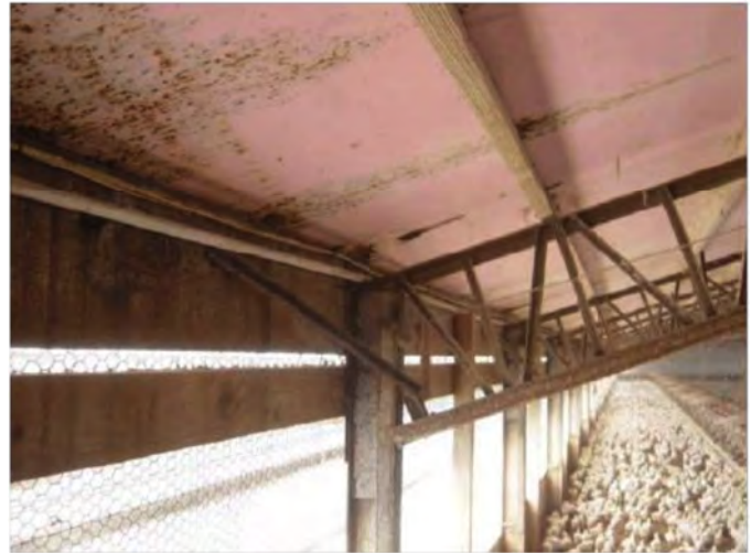
Figure 2. Insulation damage caused by lesser mealworm.

insulation panels used in poultry house walls. This long-term structural damage can increase heating cost by up to 67 percent and result in expensive building repair costs to replace insulation panels.