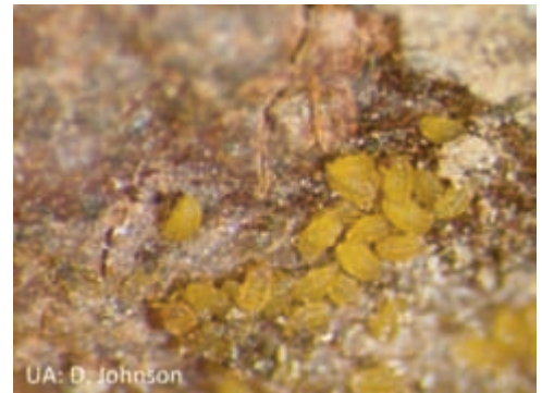
Figure 1. Root form of grape phylloxera on a grape root

In early April, eggs on the trunk hatch into first-generation yellow crawlers. These crawlers move to grape shoots to feed on the first to third expanding terminal leaves of the season. The leaf forms a gall around each crawler (Fig. 4, inside). The first generation crawlers usually form less than five galls per leaf (Fig. 4). During April and early May, each crawler matures into a fundatrix or stem mother (center of Fig. 5, inside). Each stem mother produces a second generation of 100 to 300 oblong,