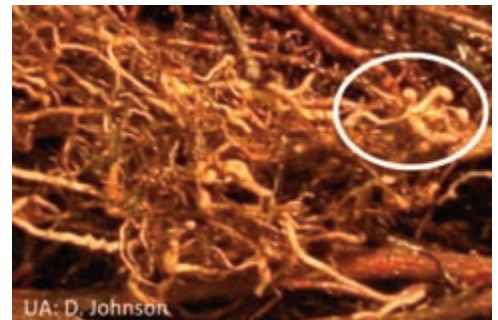
Figure 2. Root form of grape phylloxera cause swollen grape root tips called nodosities (circled)