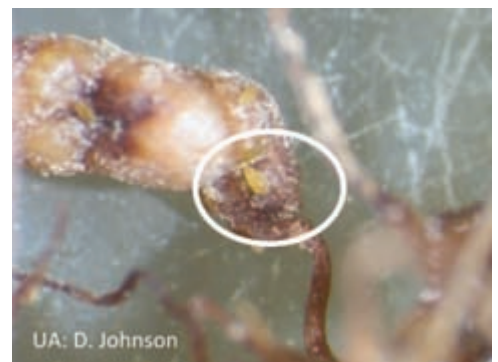
Figure 3. Root form of grape phylloxera (circled) feeding on grape root nodosities