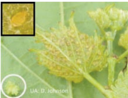
Figure 6. Mature stem mother gall (circle) on first to third mature leaf and immature, "rash-like" galls on the underside of expanding terminal leaf caused by crawler (inset) feeding on top side of leaf on June 15 (Hillsboro, MO)

yellow eggs (Fig. 5) that hatch into yellow, six-legged crawlers (circles and inset on Fig. 5).