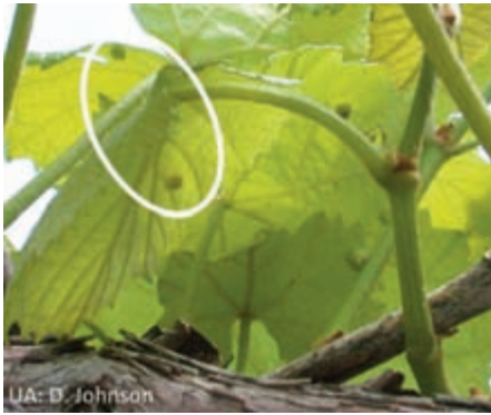
Figure 4. Mature grape phylloxera stem mother galls (circled) on first to third expanded leaves at the base of shoot in May