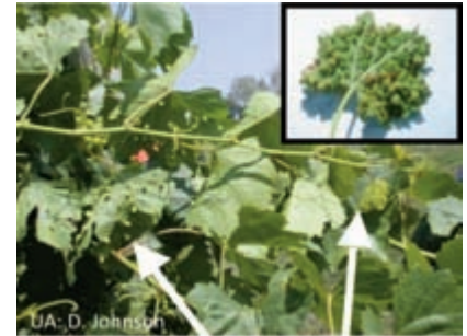
Figure 7. Second and third generation grape phylloxera galled leaves on the same shoot and severely galled leaf (inset)

In eastern North America, foliar-infested grapes also have the root form causing nodosities on small roots but no tuberosities on larger roots (Jubb, 1978; Williams, 1979; Stevenson, 1970ab; Williams and Shambaugh, 1988; McLeod and Williams, 1991, 1994). Bates et al. (2001) found that root grape phylloxera alone, lack of irrigation alone and combination of root grape phylloxera and water stress caused 21, 34 and 54 percent decreased 'Concord' vine dry mass, respectively.