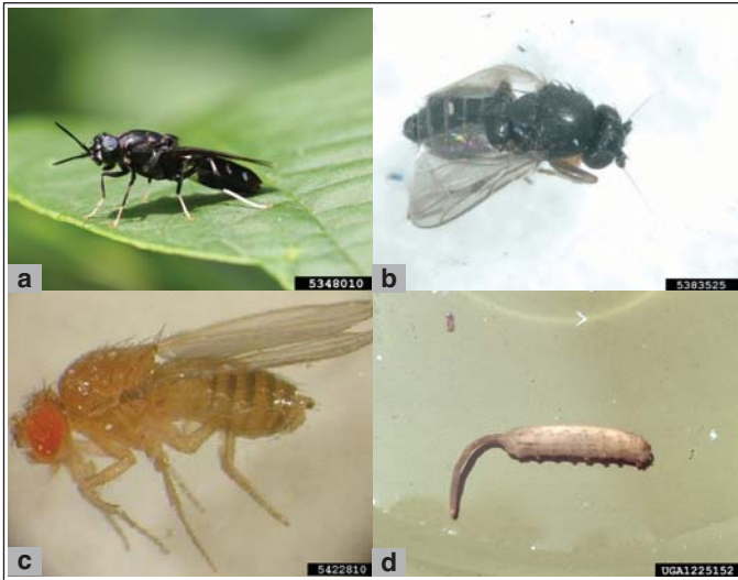
Figure 6. (a) Soldier fly, (b) small dung fly, (c) common fruit fly and (d) rattailed maggot

Soldier flies (Figure 6a), small dung flies (6b), fruit flies (6c) and rattailed maggots (6d) are some of the other flies that can be found in poultry production facilities.