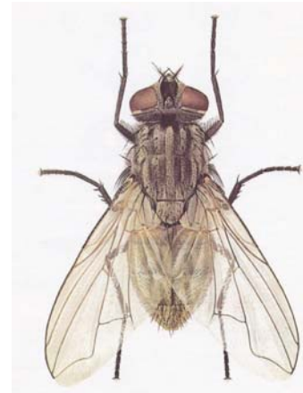
Figure 1. House Fly

The house fly , Musca domestica L., (Figure 1) is the major species associated with poultry manure. This fly breeds in moist, decaying plant material, including refuse, spilled grains, spilled feed and in all kinds of manure. Poor sanitation around the poultry facility increases the probability of high house fly populations. House flies prefer sunny areas and are very active, crawling over filth, people and food products. This fly is an important mechanical vector of many human and poultry diseases (protozoa, bacteria, viruses, rickettsia, fungi and worms) and can cause fly-specking problems with eggs as well as windows and walls of buildings.