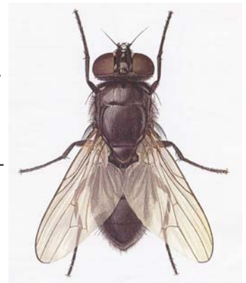
Figure 4. Dump Fly

The dump fly (black garbage fly) , Hydrotaea aenescens (Wiedemann), (Figure 4) is shiny bronze-black in color and is slightly smaller than the house fly. The life cycle of the black dump fly is similar to the house fly and is completed in 14 to 45 days. Black dump fly larvae closely resemble house fly larvae. Eggs hatch in 12 to 16 hours, the larval stage lasts a minimum of 5 days, the pupal stage lasts at least 4 days and adults live from 14 to 20 days. The black dump fly cannot withstand freezing temperatures but can be found year round under suitable conditions. Unlike the house fly and little house fly, black dump flies characteristically remain on their food source at night rather than rest on the ceiling or on outdoor vegetation. These flies have a more limited range (4 to 5 miles) than the house fly and little house fly. Larvae of the black dump fly can be predaceous on other fly larvae and have been known to decimate house fly populations. This beneficial aspect can be overshadowed by the fact that large numbers can develop on the farm, and adults will disperse into nearby communities. In addition, the black dump fly is now known to have organisms that cause disease ( Salmonella , Campylobacter , E. coli ) on its body surface or in its digestive system, much the same as the house fly.