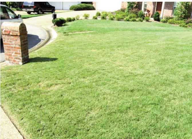
Figure 4. Mild symptoms from nematode infection can appear similar to many other plant stresses including drought, nutrient deficiencies, pH problems and other common symptoms seen in damaged turf.

and fertilizers. Aboveground symptoms do not typically occur until injury to the turfgrass root system is well advanced. Additionally, turf may be unresponsive to applications of fungicides and insecticides since these products will not control nematodes. Once nematode populations reach a critical threshold, turfgrass death can occur (Figure 5).