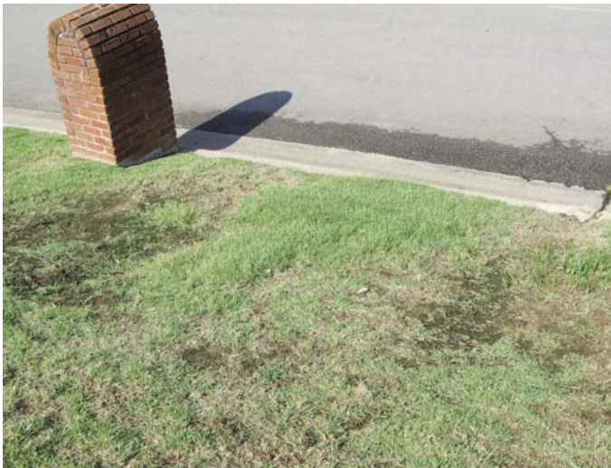
Figure 9. A large patch of bermudagrass appears (right of mailbox next to curb) symptom free in this Meyer zoysiagrass lawn weakened by nematodes.

Nematodes are often found as problems in established turf. In some situations, nematodes may already be present in the native soil at the time the lawn was established, while in some cases, the nematodes are transported to the site in the sand or soil that is used during construction. In either case, it is best to avoid or eliminate the problem if at all possible.