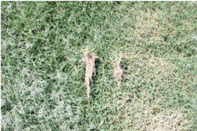
Figure 7. Decrease in bermudagrass rooting (right) caused by lance nematodes