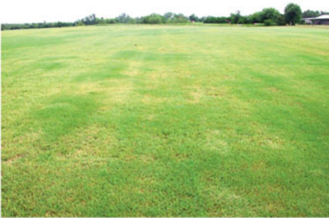
Figure 3. Typical nematode damage: Irregular areas without distinct border including yellow stunted turf that is thin and not responsive to fertilizer or irrigation

In turfgrasses, there are few definitive symptoms or signs for consistent diagnosis of a nematode problem. Generally, the symptoms of nematode damage are similar to those of other pest problems, nutritional deficiencies or environmental stresses (Figures 3 and 4). However, lawns with irregular areas of turf without distinct borders; areas of yellow, stunted plants; wilting; and thin, weedy turf would be extremely good candidates for suspecting a nematode problem. Sometimes, actual signs of nematode infection such as root galls due to the root-knot nematode or the presence of cysts attached to roots may be evident. An additional symptom of nematode damage is lack of response to irrigation, fungicides, insecticides