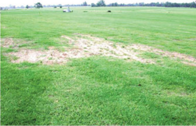
Figure 6. Lance nematode damage to bermudagrass rough

Aboveground symptoms of lance nematode damage to turfgrasses include patches of yellowing, dying and poorly rooted turf (Figures 6 and 7). It is hard to diagnose lance nematode damage just by observing symptoms, since the symptoms are similar to other stresses including insect damage, disease, drought and nutrient deficiency.