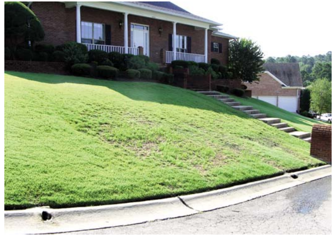
Figure 5. Once nematode populations reach a critical threshold, turfgrass death can occur, as seen in this Meyer zoysiagrass lawn.

and fertilizers. Aboveground symptoms do not typically occur until injury to the turfgrass root system is well advanced. Additionally, turf may be unresponsive to applications of fungicides and insecticides since these products will not control nematodes. Once nematode populations reach a critical threshold, turfgrass death can occur (Figure 5).