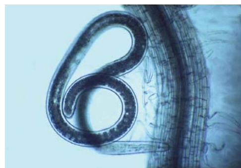
Figure 2. Parasitic nematode feeding on a plant root

Although most nematodes are beneficial and feed on fungi, bacteria and insects or help in breaking down organic matter, there are a few species that parasitize turfgrasses and cause damage, especially in sandy soils. All parasitic nematodes have a stylet (Figure 1), a protruding, needle-like mouthpart, which is used to puncture the turfgrass root and feed (Figure 2). Nematodes feed on turfgrass roots and are most abundant when the turfgrass is actively growing in the spring and fall for cool-season grasses and the summer months for warm-season grasses.