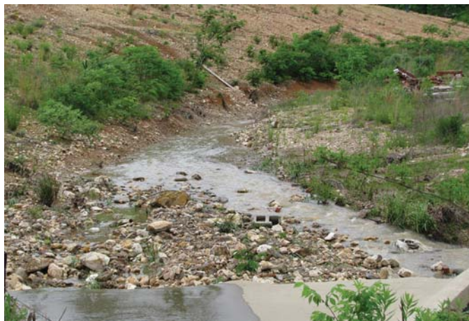
Figure 2. Unprotected waterways are vulnerable to degradation.

avoided. All of these attributes help to maintain or improve water quality within the landscape.