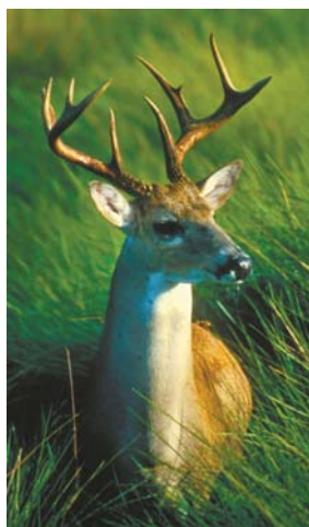
Figure 4. Riparian buffers greatly improve wildlife habitat.

growth of juvenile smallmouth bass has been found to decrease with water temperatures above 86°F. Wind speed and humidity are also altered by riparian vegetation. Removal of forested riparian vegetation leads to an increase in wind speed and reduction of humidity which may have negative impact on aquatic and riparian communities. Therefore, it is recommended that managed forests include streamside management zones (SMZs) that reduce management activity in strips of existing forested areas adjacent to streams. Establishing forested riparian buffers in