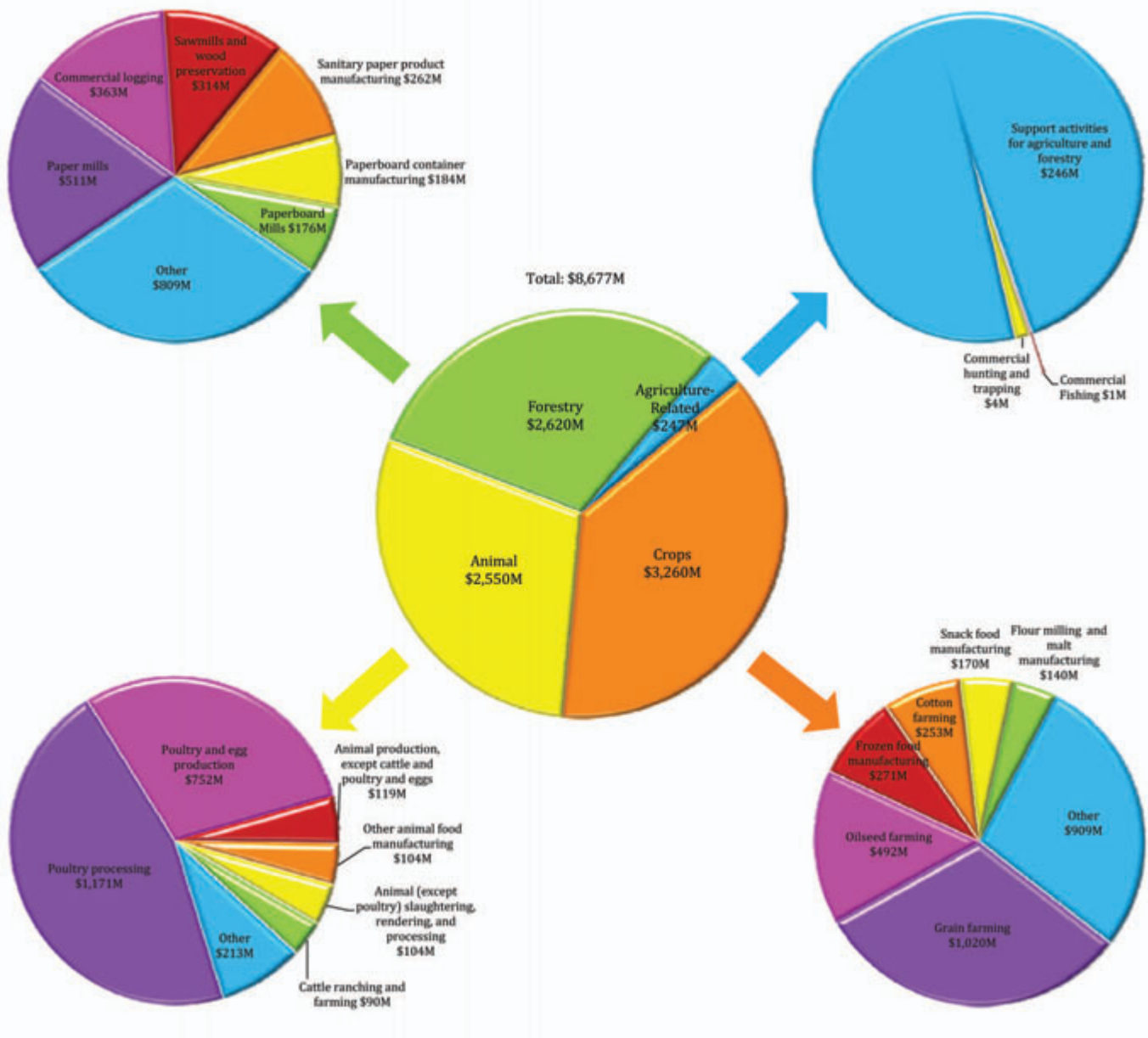
Figure 2. Direct Value Added by Industry of the Agriculture Sector in 2008

creation, income and value added throughout the state's economy. Continued strength of agriculture is of paramount importance to the social and economic fabric of Arkansas communities and to the infrastructure and services that translate into quality of life for residents.