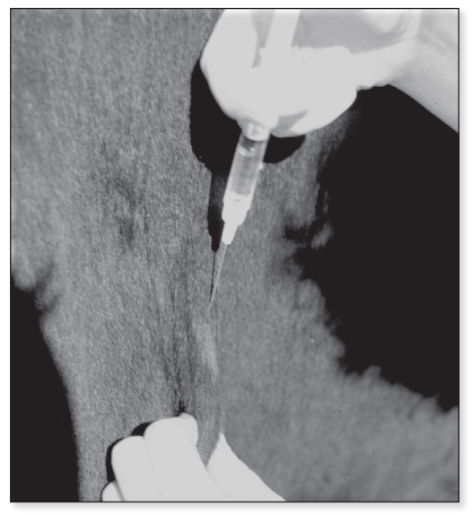
Both subcutaneous and intramuscular injections are recommended to be administered in the neck region in front of the shoulder. Injections in the rump are discouraged as these injections can damage valuable portions of the carcass.

Most vaccines are administered under the skin (subcutaneously) or in the muscle (intramuscularly). The Beef Quality Assurance (BQA) Program recommends that all vaccinations be given in front of the shoulder to avoid vaccination abscesses in the more valuable parts of the carcass.