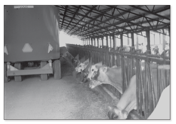
Dairy cows need to be healthy to obtain maximum benefits from good feeding.

system to produce protective antibodies that will help combat the invading disease organisms in the animal's body.