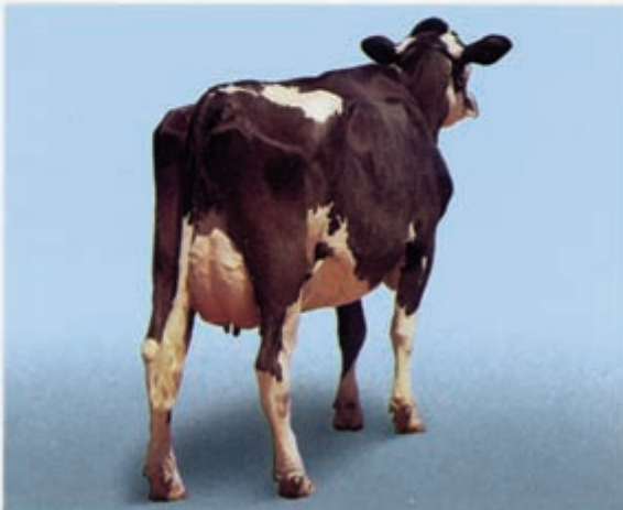
BCS = 2