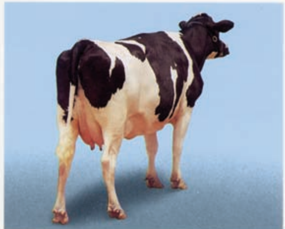
BCS = 4