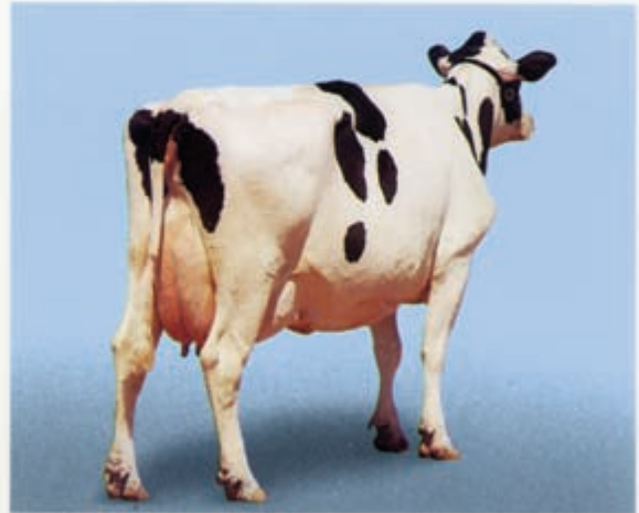
BCS = 3

Body condition scoring of cattle is an essential management tool for the progressive dairy farmer. It can be mastered with a little training and good observation skills, using both sight and touch to evaluate each cow.