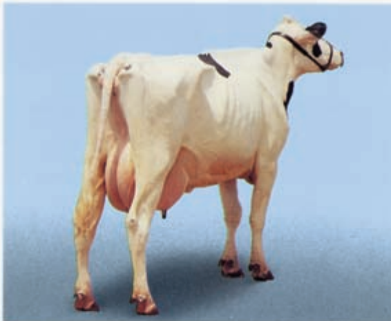
BCS = 1