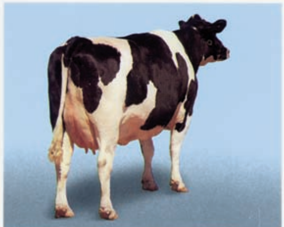
BCS = 5