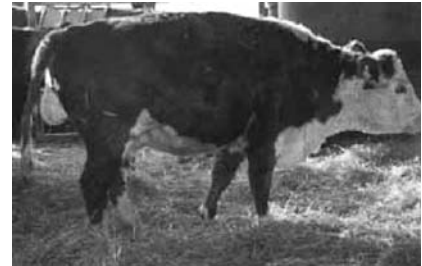
Figure 1. Cow exhibiting a water bag.

Typically, a normal delivery should be completed within one to three hours after the water bag appears. It is important to take proper action during each successive stage of labor to ensure a live calf. A couple of weeks before the calving season, cows