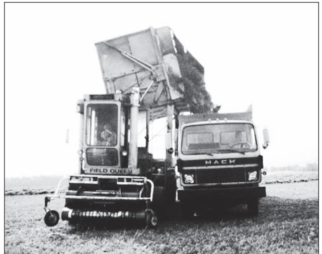
Production of silage has been relatively easy to mechanize.

Regardless of the amount of capital invested, the purchase and subsequent use of expensive silage-making equipment will not improve forage quality. Forages harvested at advanced stages of maturity will always be poor in quality. To make high-quality silage, producers always must start with high-quality forage.