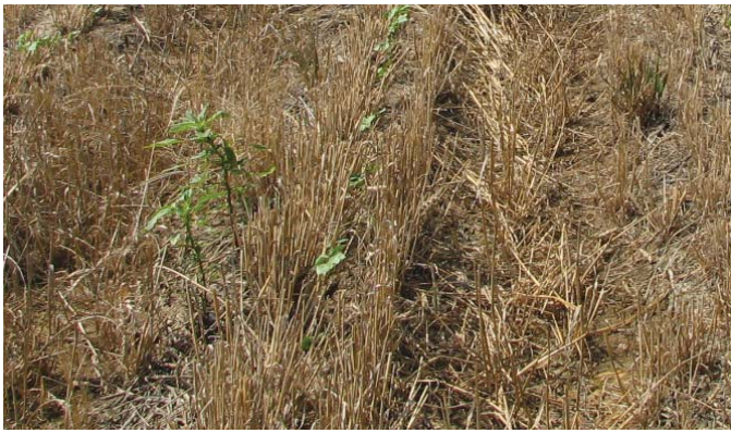
Figure 5. Large glyphosate-resistant pigweed in wheat stubble.

regularly and post-directed sprays applied as necessary to manage glyphosate-resistant pigweeds and other weeds present. It is also important for producers to check plant-back restrictions for herbicides utilized for weed management in the wheat crop. Table 3 contains selected wheat herbicides and their respective plant-back restrictions to the following cotton crop.