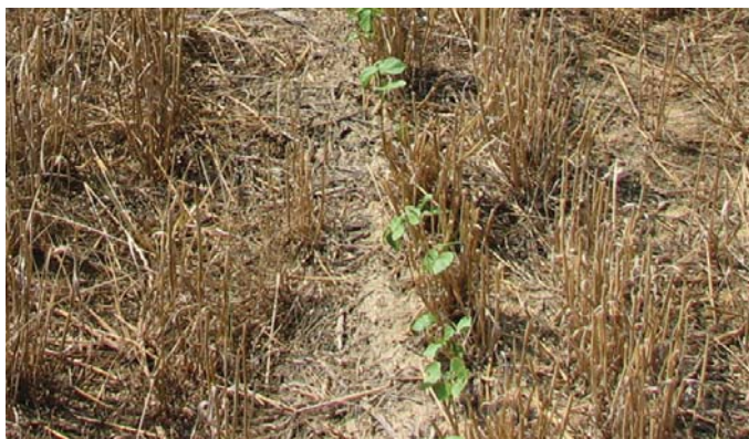
Figure 4. Emerged cotton planted in wheat stubble.

If planting cotton into stubble, wheat combines containing straw choppers should be used and set to evenly distribute the wheat straw during harvest. Cotton planters should be equipped with down pressure springs or air bladders and residue managers (trash wheels) to aid in even planting and seed-to-soil contact. Coulters in front of the double-disk openers may disturb the soil too much, resulting in an uneven seedbed, and thus may not be optimum for planting cotton into wheat stubble. Seed-firming wheels and cast iron closing wheels ensure adequate seed-to-soil contact and are recommended when planting in a no-till situation.