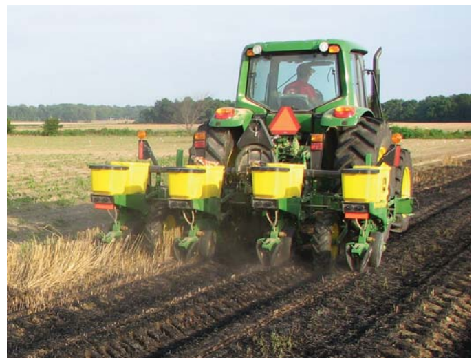
Figure 3. Planting cotton after burning wheat stubble.

Fields should be selected that contain well-drained soils and have the capability of being irrigated. It is not recommended to plant cotton following wheat on fields that cannot be irrigated. The most important consideration is to achieve an even stand of cotton that emerges quickly after planting. Ideally fields should be bedded prior to wheat planting in the fall with the integrity of the beds maintained through wheat harvest and cotton planting.