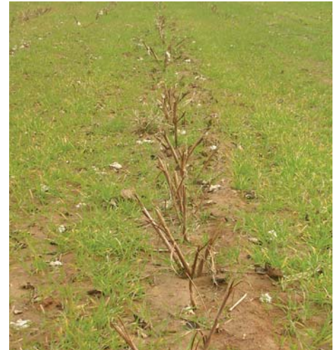
Figure 1. Wheat planted after cotton harvest.

This fact sheet covers the things to consider when planting cotton following wheat.