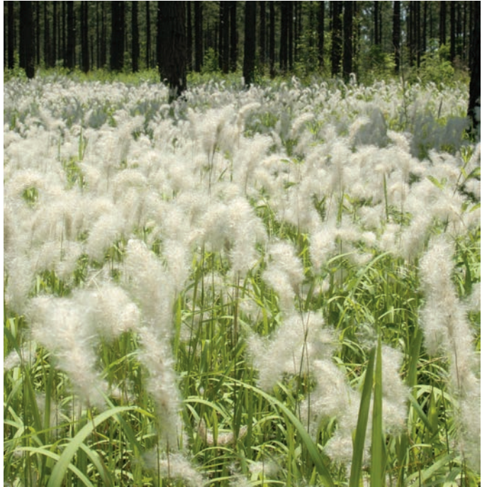
FIGURE 5. Cogongrass seedheads have a feathery plume appearance and may be 2 to 8 inches long.

prone to erosion and that are free of rocks, young infestations can be controlled with repeated tillage over the season. The initial tillage should begin in the spring (March through May) to a depth of at least 6 inches and should be repeated every six to eight weeks. It is important to clean all equipment on site to prevent the spread of rhizomes. The site should be replanted with a suitable grass or cover crop as soon as the cogongrass infestation is under control. Mowing may help reduce cogongrass stands. Areas must be mowed frequently and at a low height.