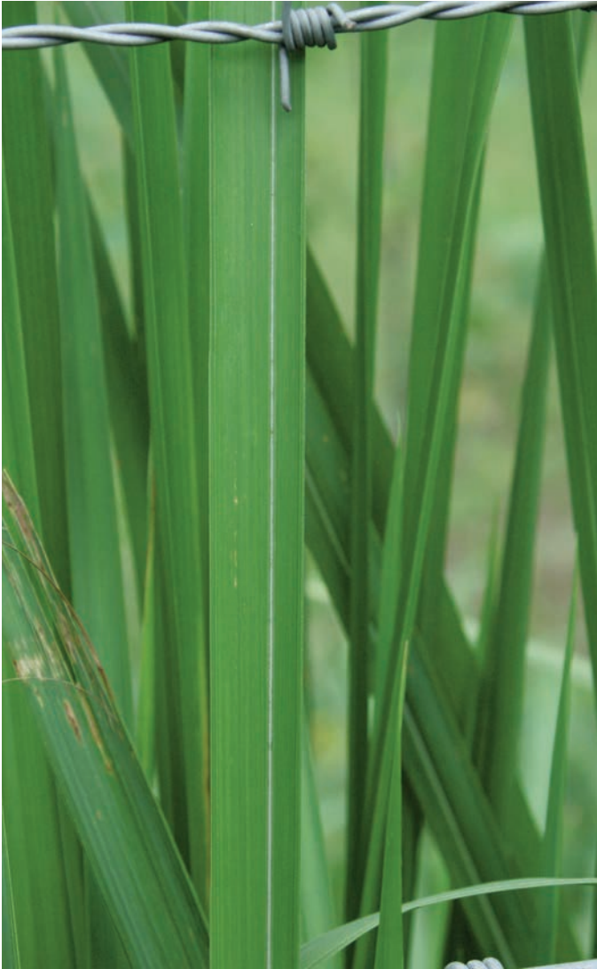
FIGURE 3. Cogongrass leaves have a prominent midrib offset to one side, especially toward the leaf tip.

vegetatively until unrelated patches grow close enough for cross-pollination to occur, allowing viable seed production. But in Mississippi, seed germination from first-year cogongrass populations was over 95 percent. Cogongrass seed has little dormancy, and research has shown it loses viability after one year.