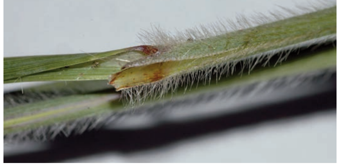
FIGURE 4. Cogongrass has a hairy ligule and may or may not have a hairy leaf sheath.

Cogongrass does not persist under tillage and is not likely to infest cultivated fields. In areas not