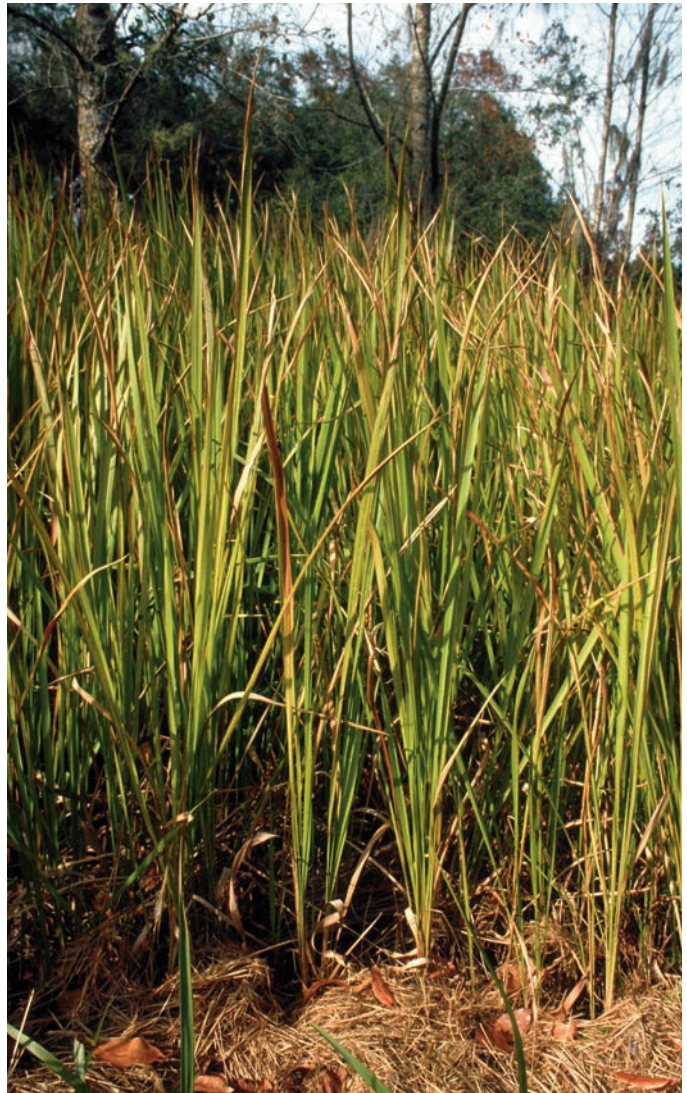
FIGURE 2. Cogongrass infestation. Note the leaves rising from the ground in clumps within the patch.

Cogongrass spreads naturally by rhizomes and windblown seed. Seed may also be carried on vehicles or on mowers and other machinery. Rhizomes and viable vegetative plant parts may be spread through soil on equipment and through fill dirt as well. The seed requires light for germination, which favors establishment in open and disturbed areas having little plant competition. Seedlings are frequently