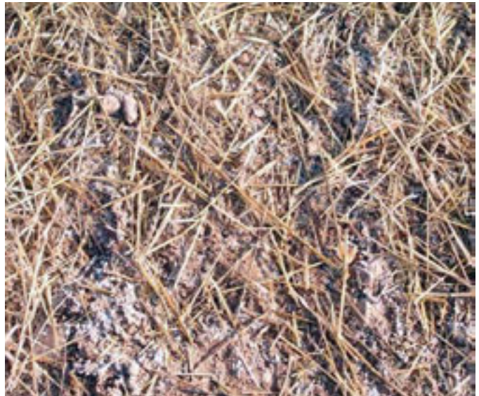
Figure 3. Straw should be applied lightly. Applying too much will shade out germinating seedlings.