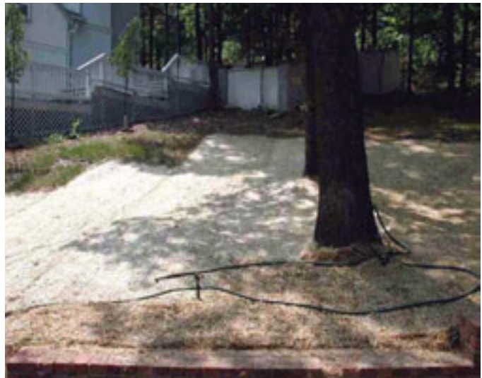
Figure 4. Various erosion control blankets can be used on slopes to help reduce erosion and retain soil moisture during establishment.

straw. Applying straw too thick can be detrimental to establishment and require removal after seedling germination. About 50 percent of the soil should be visible after mulching. There are many other erosion blankets available to help prevent erosion and increase soil temperature and moisture-holding capacity (Figure 4). These materials are often constructed out of jute, coconut fiber, excelsior, polypropylene and paper-based products. Some blankets are permanent, while others are to be removed after seed germination. Read and follow the manufacturer's instructions for best results.