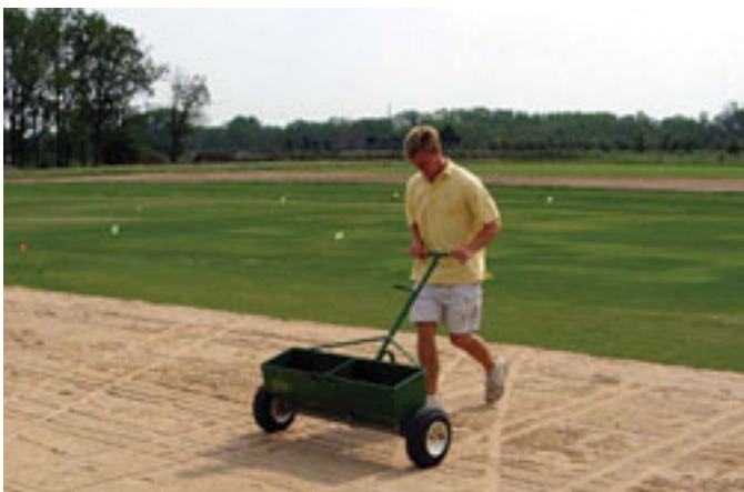
Figure 2. Seeding an area with a drop seeder.

While mulching is not essential for lawn establishment, it will help prevent erosion on sloped sites, conserve moisture and reduce seed loss from wind, birds and washing. Weed-free straw is a good choice for mulching. One square bale of straw typically covers 1,000 square feet (Figure 3). The tendency for most homeowners is to apply too much