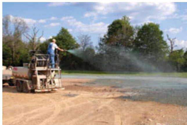
Figure 5. Arkansas lawn being established by hydroseeding.

Hydroseeding is the process where professionals apply seed in a water, fertilizer and mulch slurry (Figure 5). This process was developed in 1953 by Charles Finn in order to help establish turf on