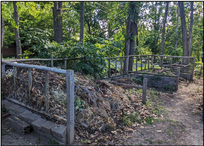
Figure 3. A series of bins used to speed composting.

turning the compost, more oxygen is provided to the microbes decomposing the wastes.