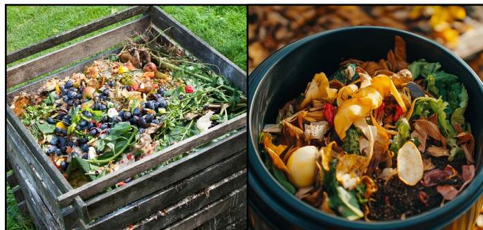
Figure 2. Examples of units to hold yard and garden wastes until composting is complete.

The approach depends on the time that finished compost is desired, materials and space available. Turning units require regular (weekly or biweekly) maintenance. To turn a compost pile, use a shovel or a pitchfork to invert the compost material and agitate the pile. Turning will introduce oxygen, break up congealed mats (common with grass clippings) and mix the microorganisms to new food sources in the pile. Turning a pile may also mean moving compost from one bin to another in a multi-bin system. If kitchen wastes are to be composted without other materials, worm composting or soil incorporation (burying) should be used. To turn a compost pile, use a shovel or a pitchfork to invert the compost material and agitate the pile. Turning will introduce oxygen, break up congealed mats (common with grass clippings) and mix the microorganisms to new food sources in the pile. Turning a pile may also mean moving compost from one bin to another in a multi-bin system. If kitchen wastes will be mixed with yard wastes, the turning method is recommended. However, holding units or heaps may work when precautions are taken to minimize pest problems. Turning the pile frequently by using a pitchfork or shovel to agitate