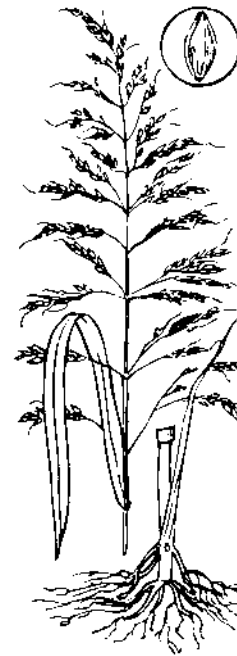
Figure 2. Sudangrass

Summer annual forages are often planted to provide supplemental grazing, hay or silage for livestock. This is especially important for livestock that require higher nutrient densities to maintain acceptable weight gains or milk production.