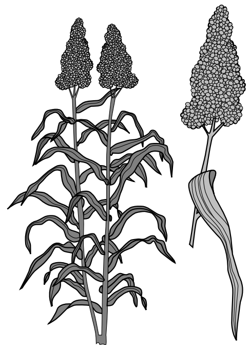
Figure 3. Sorghum