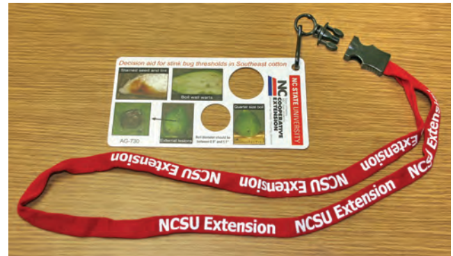
Figure 3. Lanyard with a quick disconnect for removing the aid to measure boll diameter.