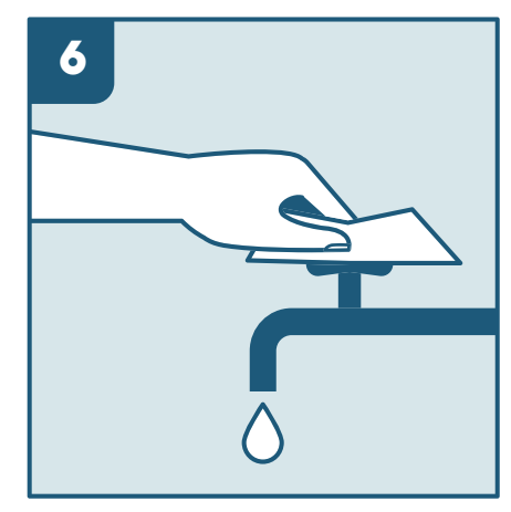
USE PAPER TOWEL TO TURN OFF FAUCET