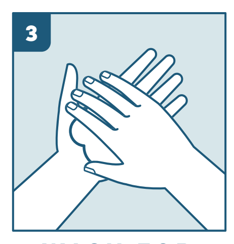
WASH FOR 20 SECONDS