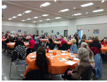
Great Crowd! & Great Food!