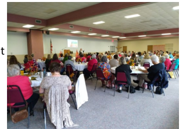
Ouachita Rally Attendee's. Great interactive crowd!