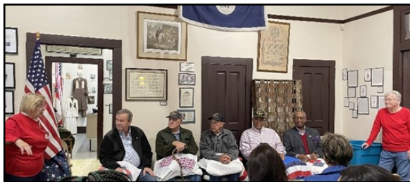
The five veterans.