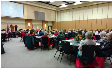
Great Delta Attendance!