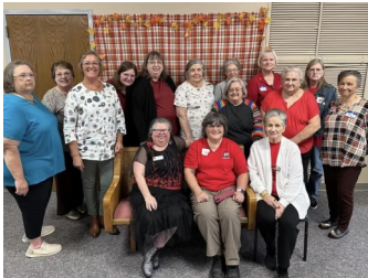
Saline Co. EH members helped with setup! Thanks!