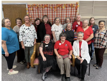
Saline County EH members attending the Ouachita District Rally at the Sharon Baptist Church in Benton.