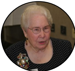
NVON President 1995-1998