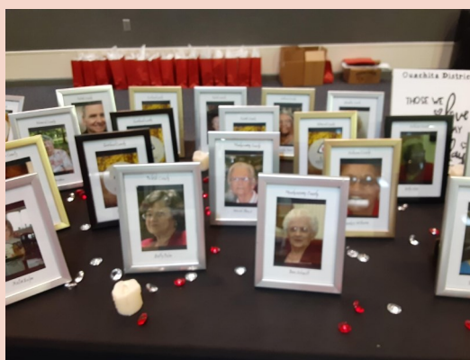
Memorial Table Individual pictures of all