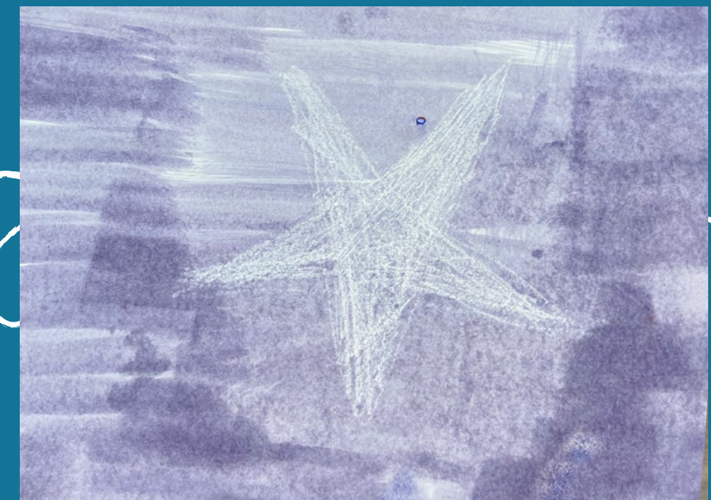
Combine water and paint so that the paint is thin, to almost watercolor consistency. Paint over the picture with the paint so that it will appear.