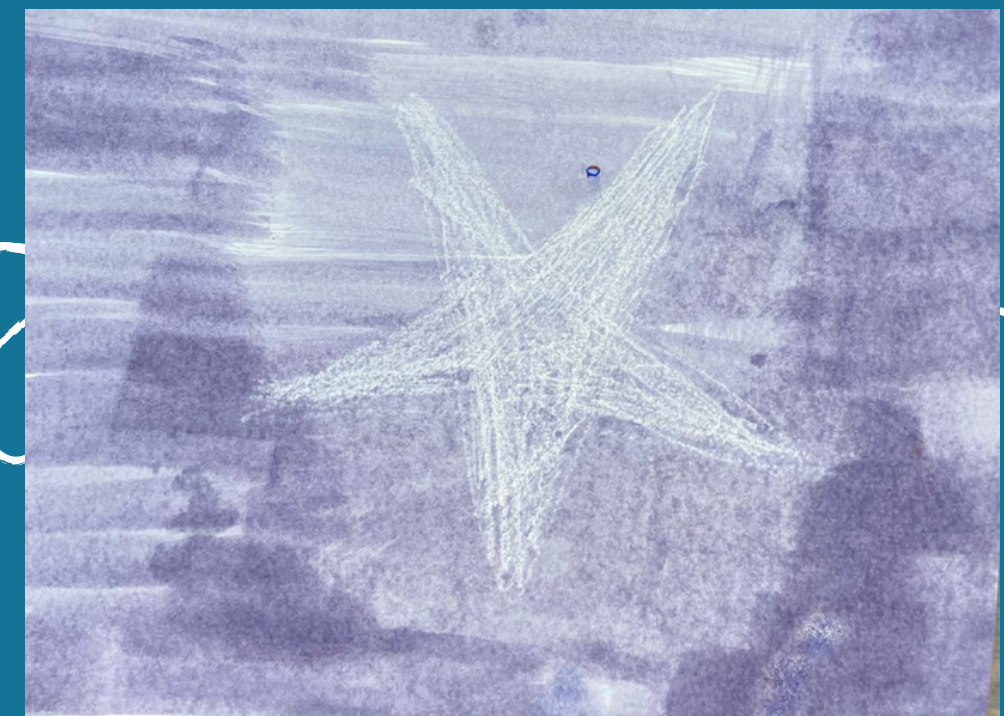
Combine water and paint so that the paint is thin, to almost watercolor consistency. Paint over the picture with the paint so that it will appear.