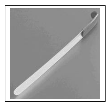
Figure 3: Long Handled Shoehorn