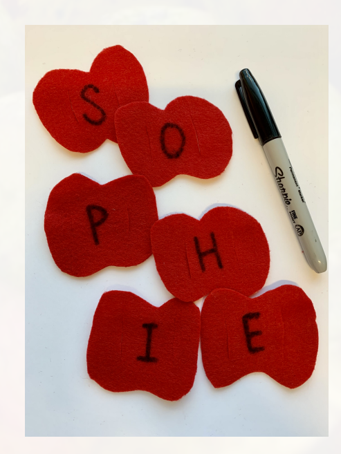
Label the apples with individual letters to spell the child's name.

Tie a knot at the end of the green felt or ribbon and slip 3 beads onto it (this will be the side that is strung through the apples). On the opposite side of the felt string tie a knot as well. This helps the felt/ribbon be sturdier for when the child is threading.