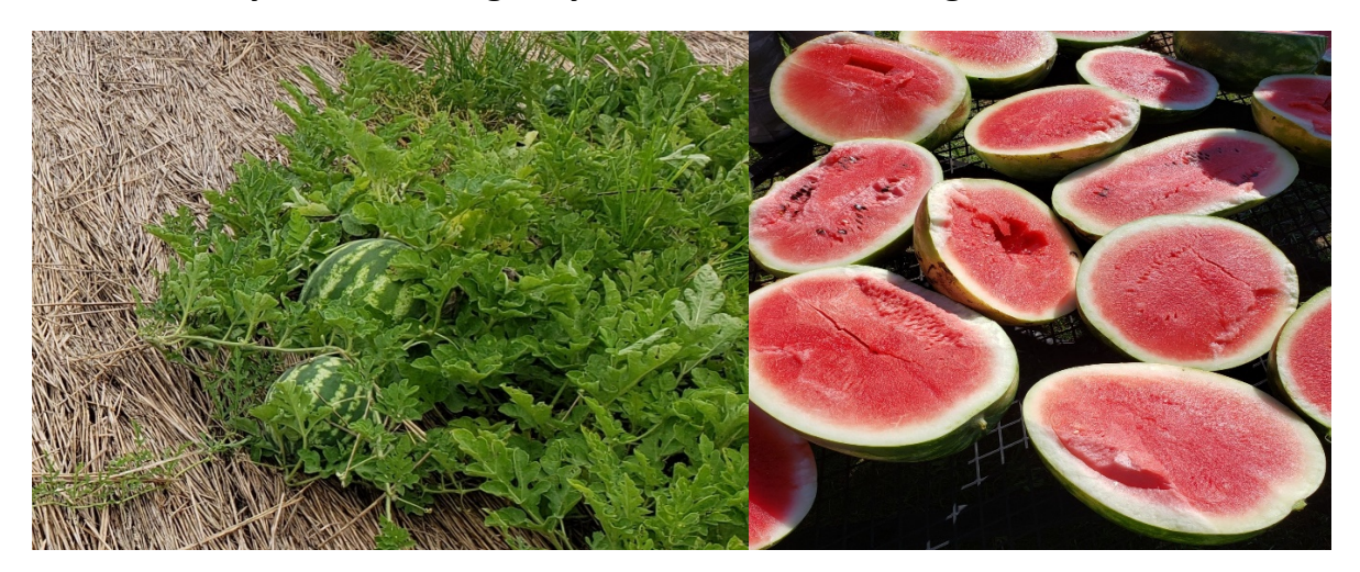
Exploring Winter Cover Crops for No-Till Watermelon Production Virtual Field Trip

Grades 9-12 Integrated Biology, Environmental Science and Agricultural Science Arkansas NGSS Suggestions: