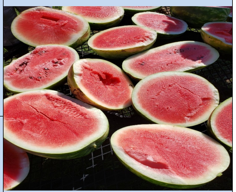
Exploring Winter Cover Crops for No-Till Watermelon Production Virtual Field Trip

Performance Expectations (Standard) from State Standards or NGSS: