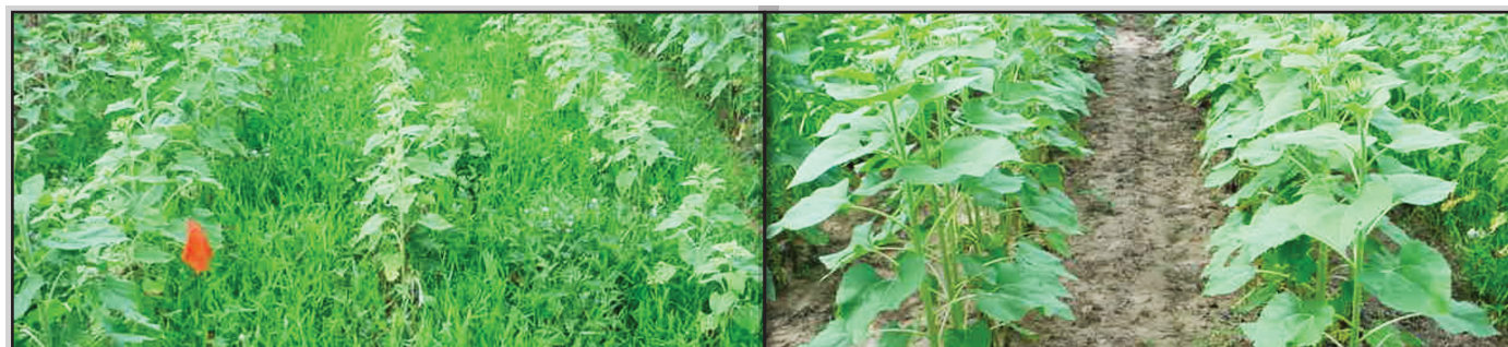
Figure 2. Nontreated control (left) versus recommended weed control strategies (right) such as planting into a clean seed bed, using a preemergence residual herbicide, and implementing interrow cultivation.