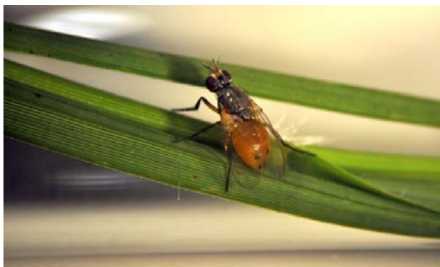
Fig. 4. Bermudagrass stem maggot adult. Note the four black spots on its abdomen.