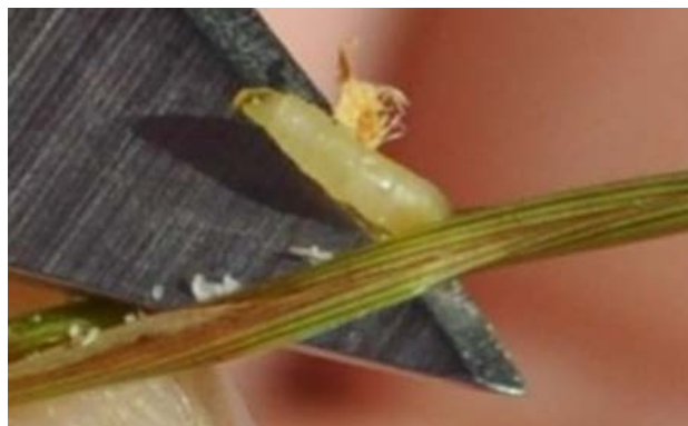
Fig. 5. Bermudagrass stem maggot larvae.

In general, this pest is less of a problem in coarse stemmed bermudagrass varieties (Tifton 85 and others) and bermudagrass that is grazed. In grazed pastures, cattle eat the fly eggs and maggots along with the grass, lessening population build up. Bermudagrass stem maggots may become an economic pest in finer stemmed varieties (common, Coastal, Alicia and others) that are baled for hay, especially later in the season after the population builds. In heavy infestations, regrowth after cutting can be slowed substantially. Bermudagrass stem maggot management demonstrations have shown as much as 50% yield loss in fine-stemmed varieties. Figure 6 shows a bermudagrass field with significant damage in untreated versus the pyrethroid treated area.