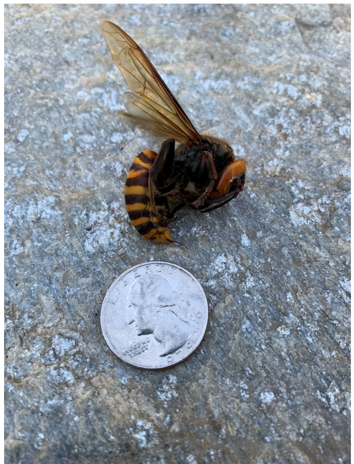
Asian giant hornet queen found near Custer WA, on May 27, 2020.

. On Saturday, June 6, a resident in Bellingham, WA used the program to report finding a suspected Asian giant hornet on their porch. The specimen was photographed and collected and a report was submitted to the WSDA. WSDA was able to collect the physical specimen and on June 11, 2020 and state and federal labs quickly confirmed the specimen as an Asian giant