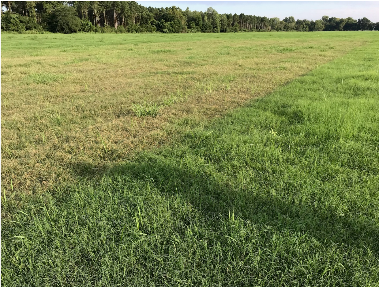
Fig. 6. Pyrethroid treated verses non-treated areas of a bermudagrass field infested with bermudagrass stem maggots.

Systemic insecticides and insect growth regulators labeled for use in bermudagrass forage are not effective in combatting bermudagrass stem maggot damage. Effective insecticide applications are aimed at killing the egg-laying adults. When applied from seven to ten days following harvest, a pyrethroid insecticide application will usually protect the crop until the next cutting. Timing of the pyrethroid application is critical for two reasons. First, the grass has resprouted and adults are emerging from larvae that pupated at the time of cutting and are ready to lay eggs. Second, pyrethroid applications made after the seven to ten-day treatment window are less effective because some eggs have already been laid and the grass canopy may be too thick for the pyrethroid application to penetrate the area where adults rest. In many situations, early cutting is necessary to allow for a successful treatment to prevent significant yield loss in the next cutting. Pyrethroid insecticides such as lambda-cyhalothrin and others labeled for use in forage grass are the most cost-effective product choices.