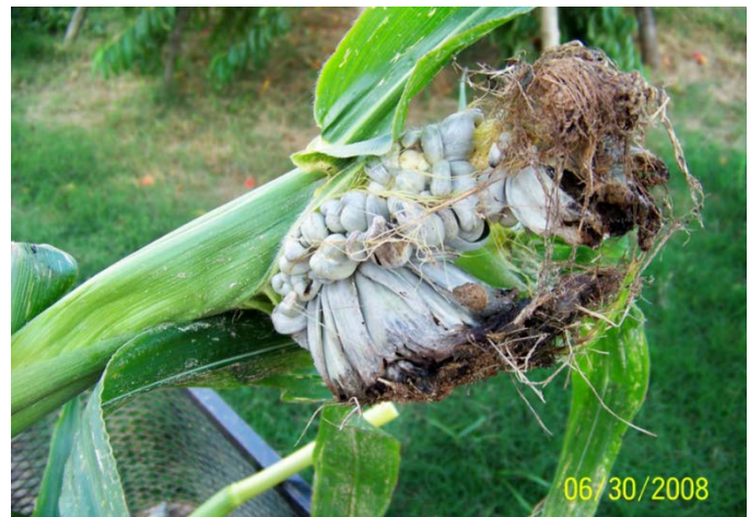
Corn Smut.

University of Arkansas, United States Department of Agriculture and County Governments Cooperating.