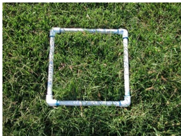
Figure 2. Mixed sizes of fall armyworms (left) and fall armyworm sampling square (right).

University of Arkansas, United States Department of Agriculture and County Governments Cooperating.