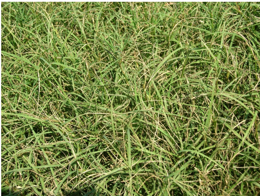
Fig. 3. Bermudagrass stem maggot damage.

The adult fly is small (approx. 1/8 inch in length) and yellow colored with four prominent black spots on the abdomen (Fig. 4). The maggot (larva) is also yellowish colored and about 1/8 inch in length when fully mature (Fig. 5).