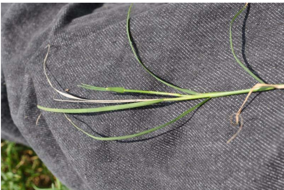
Fig. 2. Typical damage caused by the bermudagrass stem maggot. Note the dead upper leaves.

Damage caused by the bermudagrass stem maggot results from larval stages (maggots) feeding in the shoot causing the top two or three leaves to die (Fig. 2). Lower leaves remain alive and unaffected by the maggot's feeding. Because of the death of the top couple of leaves, the plant (and field, if heavily infested) may exhibit a frosted appearance (Fig. 3). The life cycle from egg to adult requires about three weeks. Adult female flies will lay eggs on the bermudagrass stem near a node. The maggot will hatch from the egg, crawl up to toward the last plant node (where the leaf blade emerges from the stem)