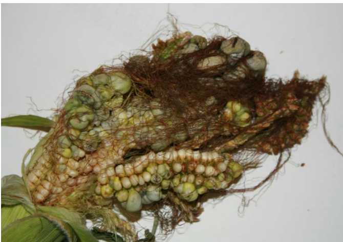
Corn Smut. By Adam Willis, University of Arkansas Cooperative Extension.

Corn Smut, caused by the fungus Ustilago maydis , can produce startling symptoms, but is generally not considered a serious pathogen. Annual losses seldom exceed 2% where resistant cultivars are grown. Although all above-ground parts of the plant can be infected, Corn smut is most spectacular when kernels are infected. Large galls form instead of normal kernels when the fungus invades the kernels and starts growing. Galls begins as glistening silvery white to greenish white, but eventually darkens and becomes a mass of powdery, dark olive brown to black spores. The incidence of smut is