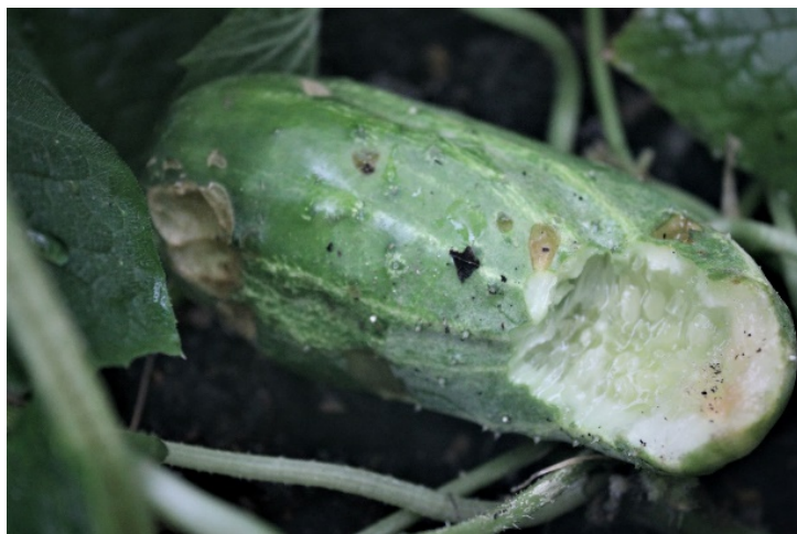
Bite marks on a cucumber.

Step 1: Who’s the culprit? Consider the circumstances to narrow the range of possible culprits. Are there tracks or visual evidence of possible suspects? This particular cucumber (see picture) was grown in a container off the ground, making it less likely a turtle or rabbit caused the damage. The bite marks are unlike a turtle, but more like a mammal with teeth. A bird would leave a bill-shaped hole; plus, birds typically prefer fruit, such as apples or strawberries.