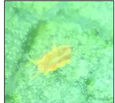
Picture 1 – Broad mite observed on leaves of blackberry primocanes on 6/25/2020.

Blackberry harvest across the state is in full swing and most growers are focused on spotted wing drosophila management (SWD). Managing SWD often involves using weekly sprays of broad-spectrum insecticides such as pyrethroids or organophosphates, which we know can limit the ability of our natural enemies (predators and parasitoids) to suppress pest species like mites or aphids. Broad mite is a species of mite that we usually start to see in the heat of the summer due to its subtropical origin, which coincides with unprotected blackberries that have a disrupted natural enemy complex. With the moderate winter we had this past year, there's no surprise that we've already started to see broad mite in our plots at Clarsville (Picture 1).