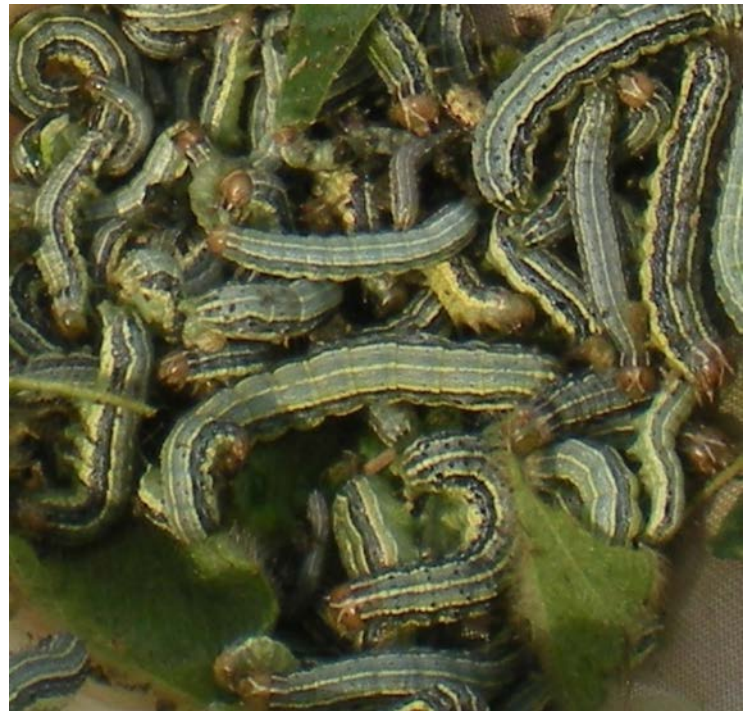
Figure 1. Fall Armyworms ( Spodoptera frugiperda ).

To date, I'm not aware of fall armyworm infestations in bermudagrass requiring insecticide treatment. However, Little River and Columbia Counties reported seeing a few in low numbers and I saw a few in the Arkansas River valley over the weekend (June 26, 2020). Also, some have been reported in corn. In recent years, we had already experienced severe infestations in south and southwest Arkansas. Although we haven't experienced any major fall armyworm infestations to date, the threat exists. Now through fall, we should continue scouting pastures and hayfields. Diligence is critical in identifying and managing outbreaks before significant losses occur. Infestations are easily overlooked when the caterpillars are small and eating very little. Once they grow large and consume more grass, damage becomes apparent (Fig. 1).