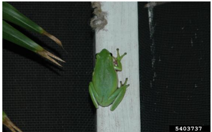
This green tree frog is searching for insects on a front porch.

Although there is no easy solution for quieting amorous frogs and toads (other than a set of ear plugs), following are some suggestions for dealing with plagues of herps appearing nightly on porches or parking areas.