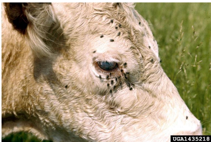
Face flies feeding on eye secretions around the eyes of a calf.

In many ways, the face fly life cycle is like the horn fly life cycle. One key similarity to the horn fly, is that the face fly will only lay eggs in fresh cattle manure. It take about 6 to 12 days, for a newly deposited egg to become a fully mature larva (maggot). Fully mature larvae transform into pupae under manure pats. Then, from 6 to 11 days later, an adult fly emerges from the pupa. During optimum conditions, it takes from 12 to 23 days for an egg to develop into an adult fly. Unlike horn flies that overwinter as pupae in the soil, face flies overwinter as adults in protected