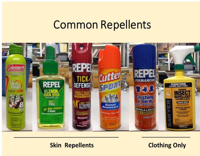
Common skin and clothing repellents.

Over the last month or so we have been seeing face flies, Musca autumnalis on cattle and horses in north Arkansas and at levels requiring treatment. Their appearance this year was several weeks earlier than we saw in 2015. Normally in Arkansas, face flies do not reach the abundance to cause