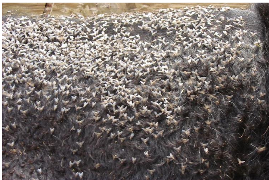
Close-up of horn flies on wither of bull.

When using insecticide impregnated ear tags always remember to rotate insecticide classes from year to year and delay application until the horn fly population approaches the threshold of 200 flies per animal. Ear tags should always be removed when the population declines in the fall or when the efficacy fails. Other methods such as forced-use self-treatment devices (dust bags and back rubbers) pour-on insecticides, passive traps and in some cases insecticide growth regulators and larvicides will provide effective horn fly control. For more information on controlling horn flies on cattle go to “Controlling Horn Flies on Cattle” at: