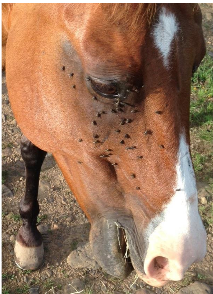
Face flies (~30) feeding around the eye of a horse.

University of Arkansas, United States Department of Agriculture and County Governments Cooperating.