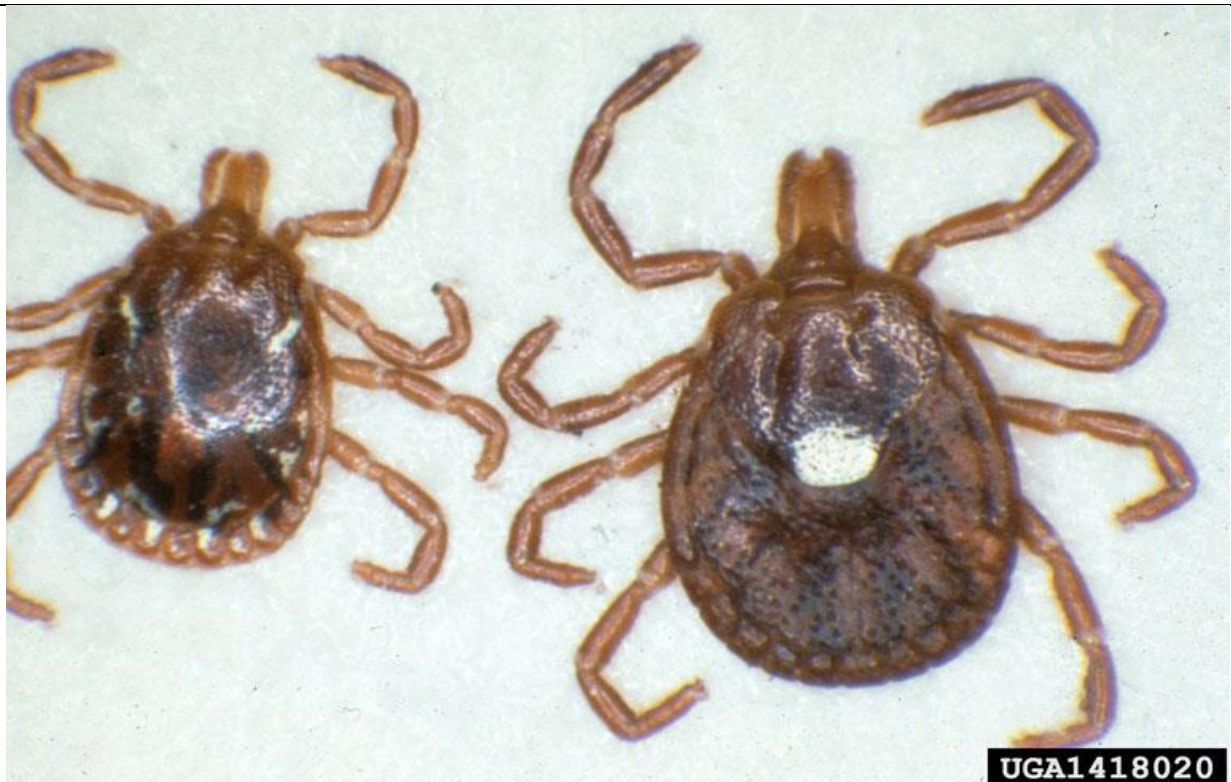
Lone star tick ( Amblyomma americanum ) (adult male left, adult female right).