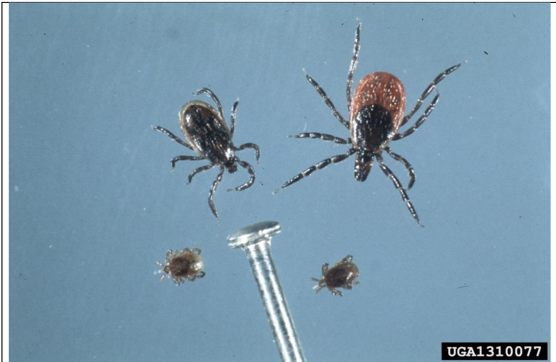
Nymphs and adult stages of black-legged tick ( Ixodes scapularis ). Male (top left), Female (top right).

University of Arkansas, United States Department of Agriculture and County Governments Cooperating.