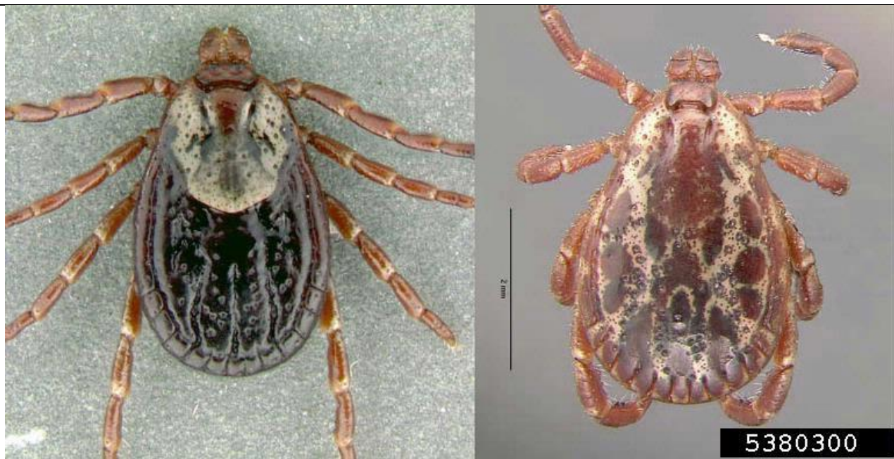
American dog tick ( Dermacentor variabilis) adult female (left) and adult male (right).

University of Arkansas, United States Department of Agriculture and County Governments Cooperating.