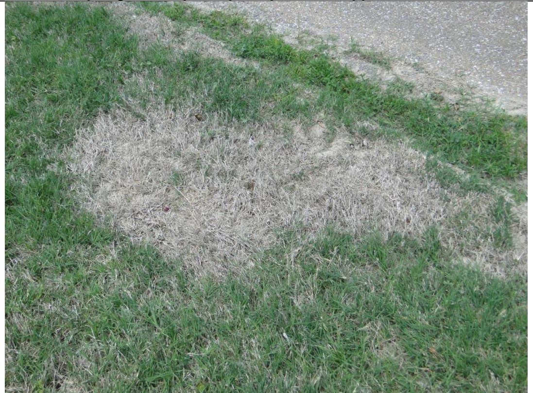
Shawn Payne University of Arkansas Cooperative Extension Service

Bermuda grass, with the patches taking the form of rings that can run together to form serpentine arcs. The roots and stolons will be severely rotted in these areas. Re-growth is extremely slow, and Bermuda that re-colonizes the dead areas remains stunted due to toxins produced by the fungi. Adequate control of Spring Dead Spot is mainly through cultural practices. Core aeration done in August or September, and practices that reduce soil compaction and improve drainage are recommended. Ammonium sulfate and potassium applications have been found to be helpful when applied in summer. Apply at least 1.0 lbs. of Potassium ( K_2O ) per 1000 sq. ft. to turfgrass during June, July or August. Maintain pH in the range of 5.5-6.5. Fungicide treatments are not always effective. A fungicide such as Heritage 50WG, or Eagle 40WSP, or Rubigan, or Disarm 480SC, or ProPensity 1.3ME, used in the fall about 30 days before dormancy gives best results when paired