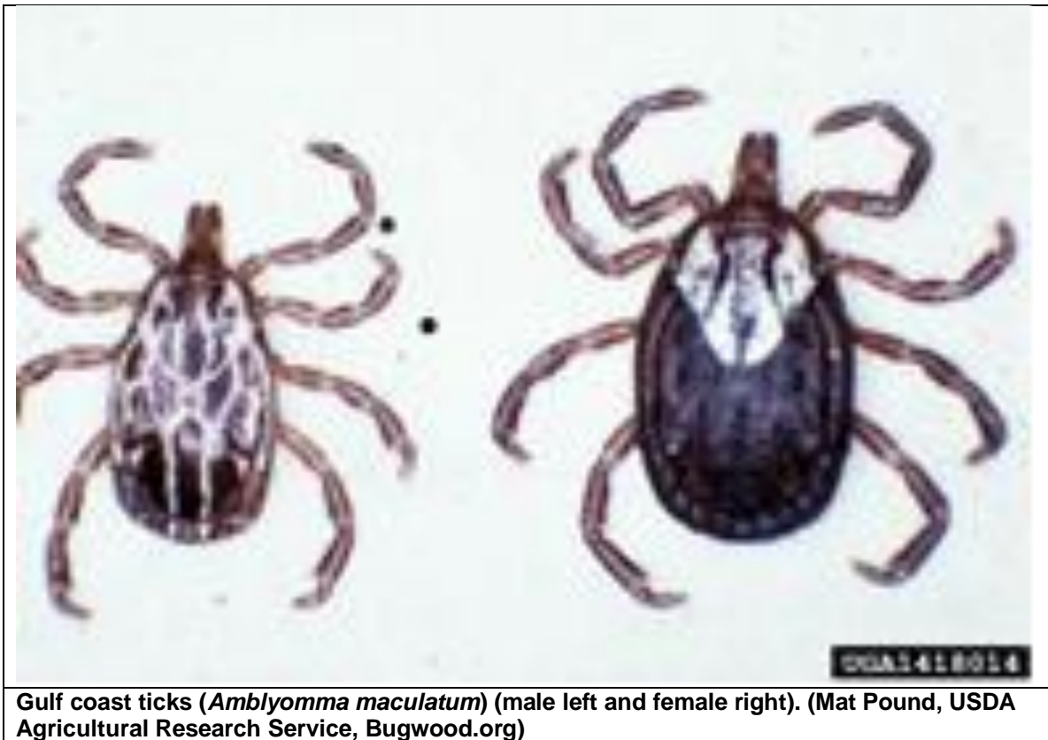
Gulf coast ticks ( Amblyomma maculatum ) (male left and female right).

Exposure of pets to tick bites can be significantly reduced by simply keeping your pets away from tick habitat. Two important factors affecting tick abundance are favorable habitat and host availability. In some situations and in small area we can reduce both habitat favorability and host availability. Ticks are less likely to inhabit frequently mowed areas of the yard. Fencing well maintained areas of your property not only keeps the dogs in but also helps keep wild tick hosts out of your yard. Keep in mind that shady areas of your yard with ample leaf litter provides the humidity necessary for tick survival. In some situation and in smaller yards where ticks are abundance and pets play, insecticide application to the yard may be considered. . However, protecting pets from tick bites may additionally involves some sort of acaricide or insecticide application to the pet. Also, it is important to check for and promptly remove attached ticks on a daily basis.