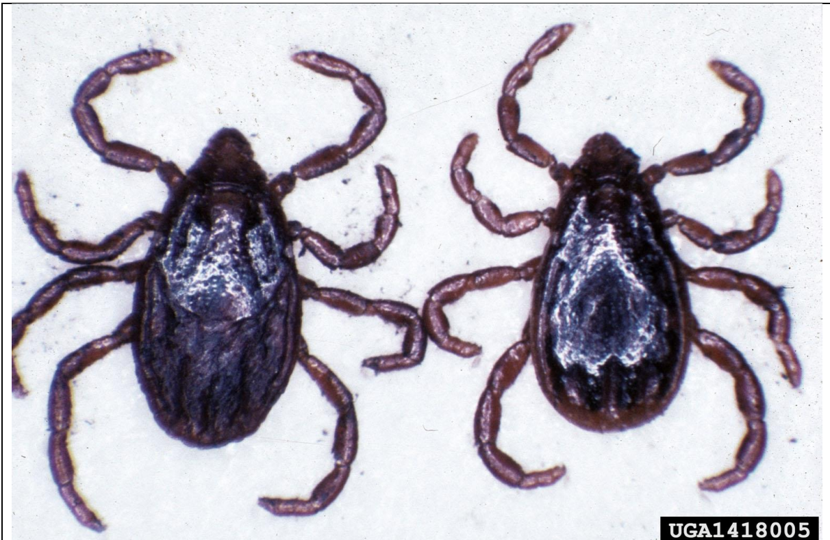
Brown dog tick female ( Rhipicephalus sanguineus ) (left) and male (right).