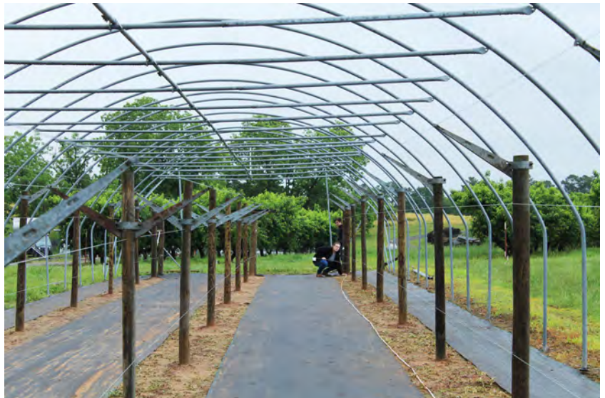
The trellis system should be in place before planting grape vines.

organic growers and will have a lifespan similar to pressure-treated lumber, though the cost will likely be higher.