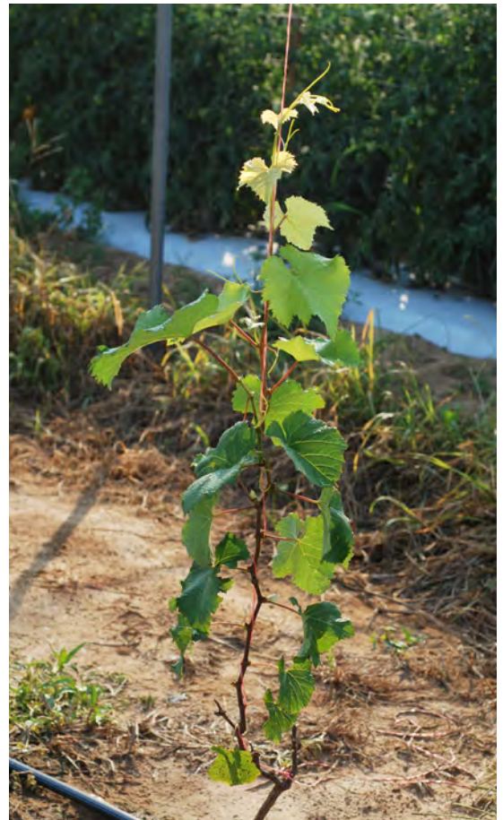
A young grape vine is trained to the trellis using a cord tied to the lower trellis wire.

For a GDC trellis, once the main shoot reaches above the middle wire, the shoot should be laid over the top of the wire and directed toward one of the fruiting wires. Once the shoot reaches the fruiting wire, its growth should be directed so that it continues to grow down the fruiting wire in one direction, with the shoot loosely wrapped around the wire and loosely tied if needed. A second shoot emerging from the main shoot below the junction with the fruiting wire should be selected and trained to become the second cordon facing the opposite direction from the first. As mentioned above, in the University of Arkansas research, high tunnel vines on the GDC trellis are managed so that each vine has two cordons on one side of the trellis only. The method will be slightly different if the goal is four cordons per vine.