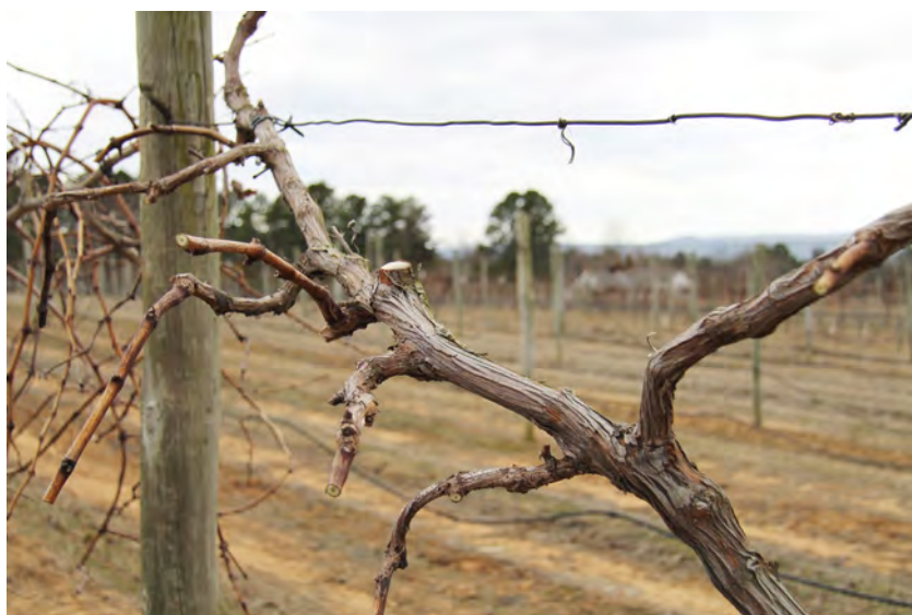
Canes should be pruned back so that there are two to six buds per spur.

method for determining how many buds to retain, called “balanced pruning,” is discussed in the next section.