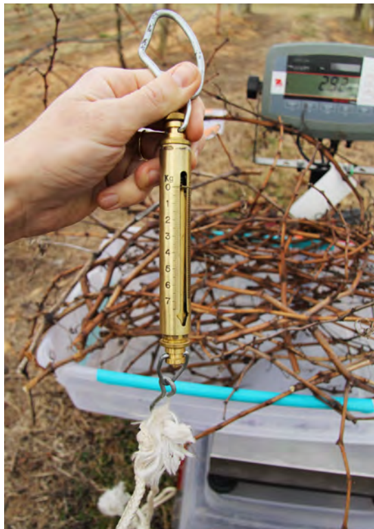
A scale should be used weigh the 1-year-old wood that was removed for balanced pruning.

be written as: (number of buds to retain) = 30 + 10 X (where X = pounds of prunings – 1). Using this formula, if 2.8 pounds of prunings were removed, then 48 buds should be retained [ 30 + (10 X 1.8) = 48 ].