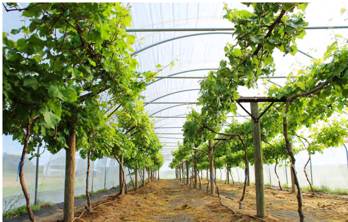
Table grapes trellised in a high tunnel at the Arkansas Agriculture Experiment Station with the Geneva Double Curtain trellis system on the right and a Modified Double High Cordon trellis system on the left.