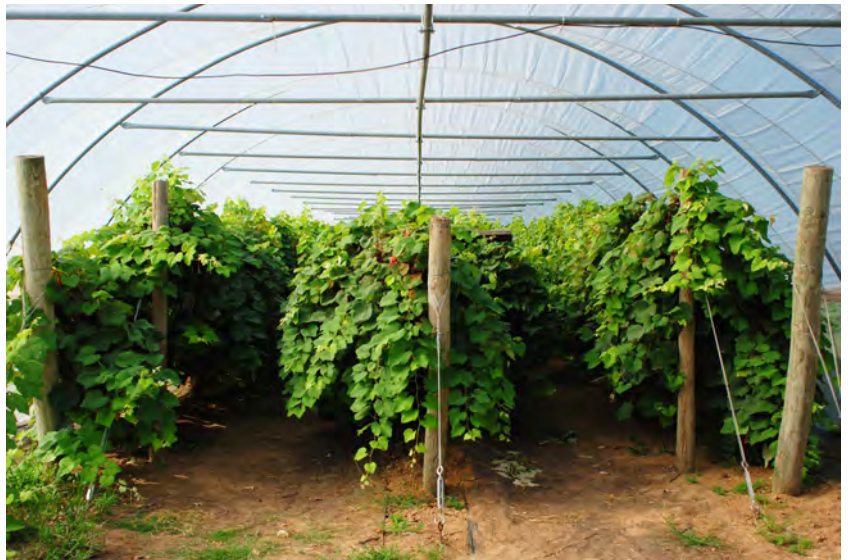
Canopy management practices are very important in the high tunnel to control vigorous vine growth and excessive shading of the fruit.

can be pruned back to the desired five feet. This will likely need to be practiced in the high tunnel because of the increased vine vigor; however, hedging should not be practiced after veraison as it can delay fruit maturity and decrease winter hardiness (Dami et al., 2005).