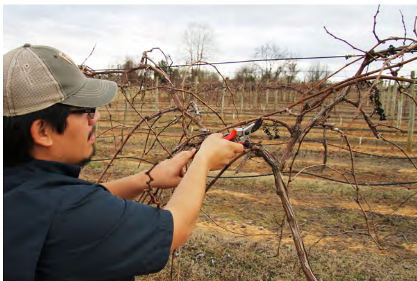
Pruning should take place in late winter while the grape vines are still dormant.

Spur pruning involves establishing semi-permanent cordons with fruiting spurs. Each fruiting spur is a 1-year-old cane that has been pruned back to two to six buds, which will produce the next year's fruit. In the winter after the cordons have been established, shoots emerging from the cordon should be pruned back to create spurs, each with two to three buds. These spurs should be spaced four to six inches apart, leaving roughly 30 buds per plant (Strik, 2011). In subsequent years, the canes should be pruned back to two to six bud spurs, leaving enough spurs so there are 20 to 60 buds per plant. A