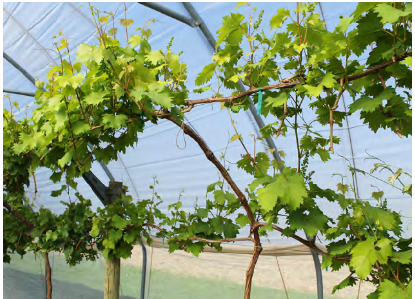
Table grapes growing on a Modified Double High Cordon (MDC) trellis system in a high tunnel.

The end posts for your trellis should be nine to 10 feet tall and 4.5 to six inches in diameter, set three feet into the ground at a slight angle leaning away from the row. Treated pine or locust posts are commonly used, and pressure-treated posts will last an additional 10 to 15 years (Dami et al., 2005). Organic growers are not allowed to use pressure-treated wood, however, and should refer to the ATTRA Publication Pressure-Treated Wood: Organic and Natural Alternatives for an explanation of the rule and a summary of options. Products such as WoodGuard™ are available for