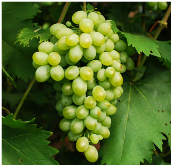
A 'Gratitude' grape cluster grown in a high tunnel at the Arkansas Agriculture Experiment Station.

Shoot hedging , or skirting, refers to the tipping of shoots that grow beyond their allocated space in the trellis system. For the DGC trellis, shoots that grow beyond five feet from the trellis wire