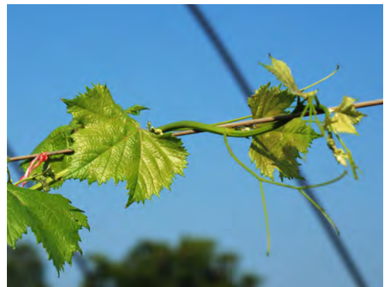
Once the shoot reaches the high wire on the MDC trellis system, it can be wrapped around the wire to become one of the four cordons.

For vines on an MDC trellis, once the main shoot reaches above the lower fruiting wire, it should be laid over the top of the wire, tied loosely, and directed towards the high fruiting wire. Once the shoot reaches the high wire, it should be trained to become one of the cordons. The shoot will need to be wrapped loosely around the high wire and tied to hold it in place. Three other shoots will be selected to become the remaining cordons.