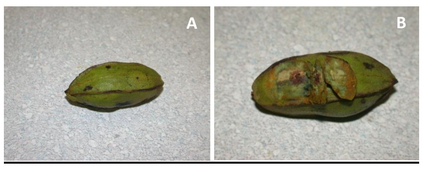
Figure 4. Pecan weevil damage consists of an A) egg laying hole with a circle of tracking marks or scratches on the shuck and B) a hole in the kernel often filled with frass from the larva feeding inside on the endocarp or pecan embryo