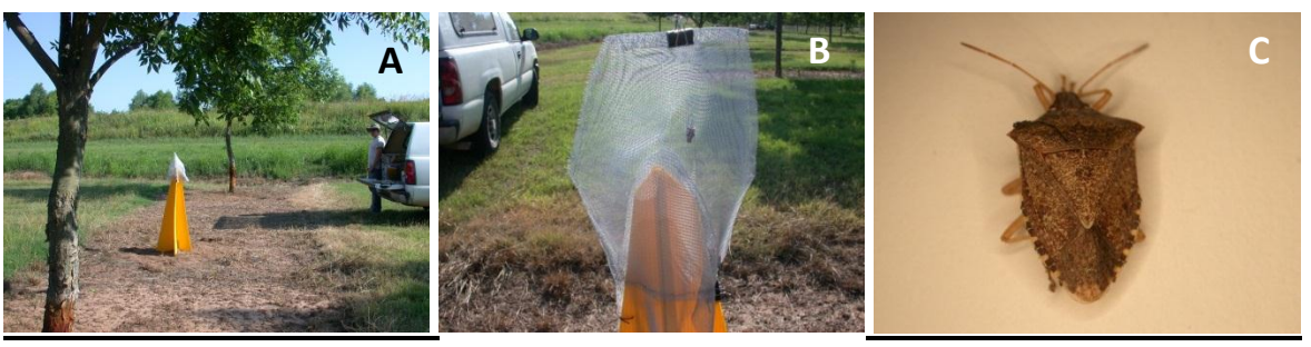
Figure 1. A) Yellow stink bug trap in a pecan orchard perimeter, B) screen cage on the top of the stink bug trap with an aggregation lure attached inside above the funnel opening, and an C) adult brown stink bug.