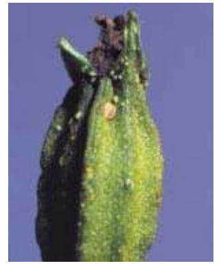
Figure 4. Pecan nut casebearer egg on nutlet.