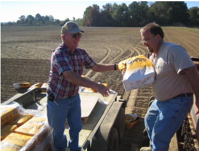
Figure 1. Getting Ready to Plant in Cross County.