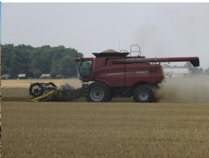
Figure 4. Harvest in Cross County.