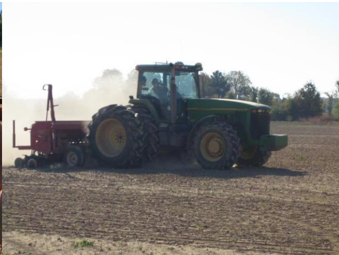
Figure 2. Planting in Cross County after Drill Calibration