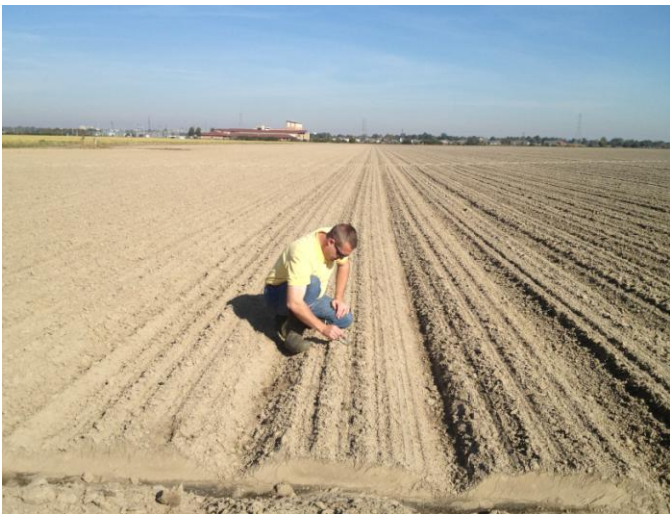
Figure 3. Checking Emergence In Arkansas County