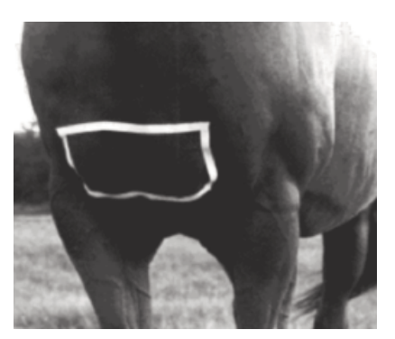
The rectangle outlines the area for an injection in the pectoral muscles. However, using this area can put the handler in an unsafe position as well as resulting in stiff, sore muscles in the horse. Thus, this area should only be used when all other areas have been exhausted.