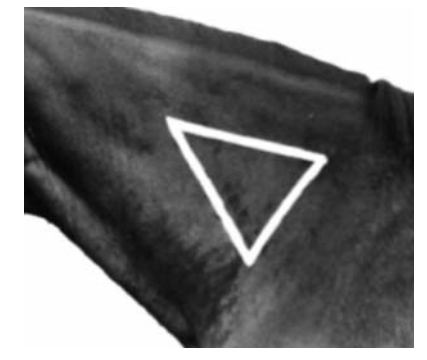
The area outlined by the white triangle indicates the proper location for intramuscular (IM) injections in the neck.