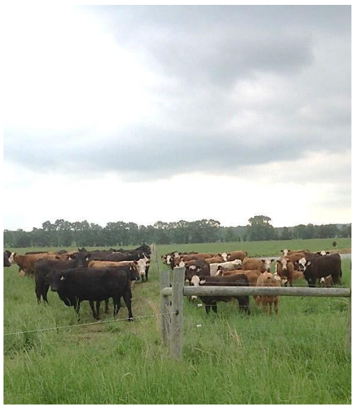
Figure of fenceline weaning.