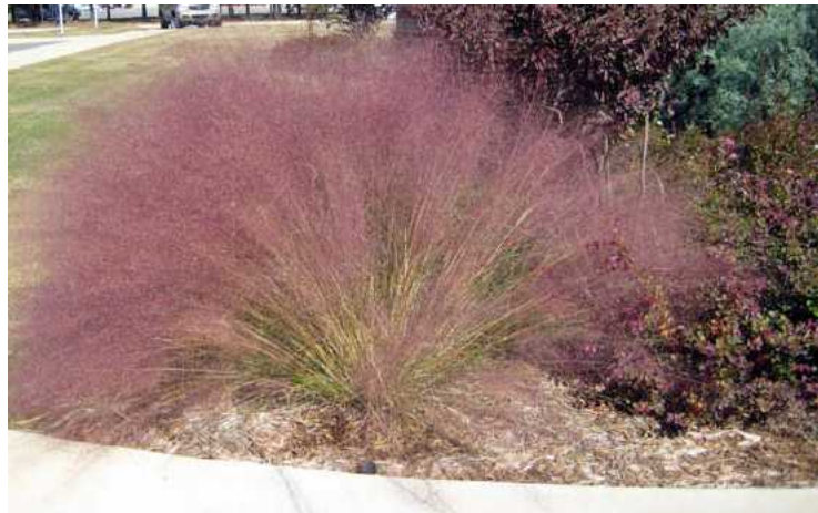
Purple Muhly Grass