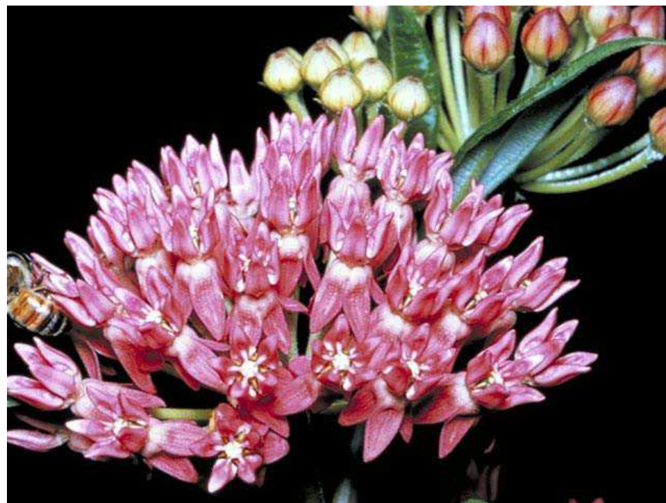
* Swamp milkweed