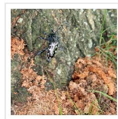
Sawdust-like material, called frass, near exit hole