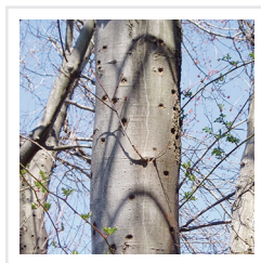
Trunk riddled with exit holes