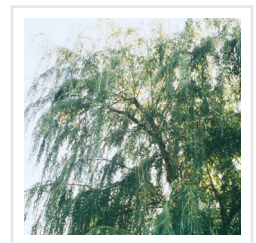
Yellowing or drooping leaves or dead branches