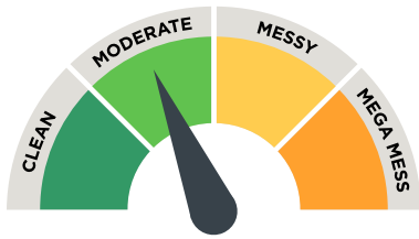
The Messy Meter