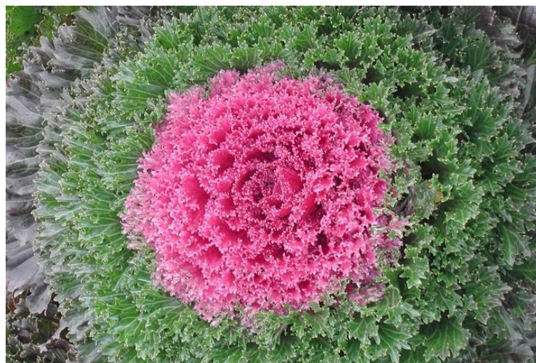
Glamour Red Kale

Rose Pink Nature Series Pansy- Sun/ part sun, cool season annual for container & landscape bed plantings. Quick to rebound after rain and frost. Extremely floriferous with pink blooms. Mounding habit, 6-10" tall.