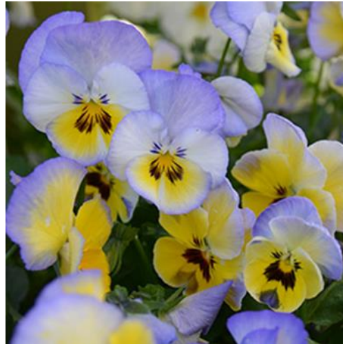
Cool Wave Blueberry Swirl