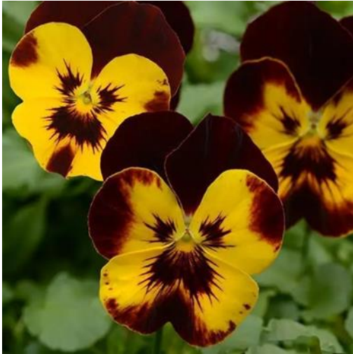
Cool Wave Fire