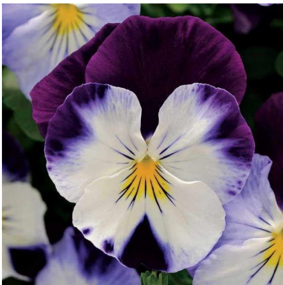
Violet Wing Cool Wave Pansy