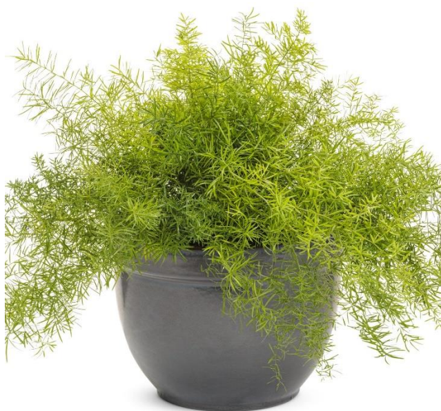
Asparagus Fern Sprengeri