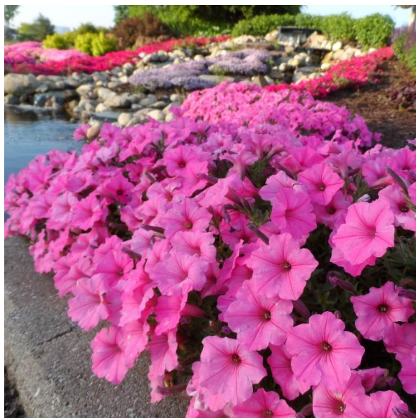
Vista Bubblegum Petunia