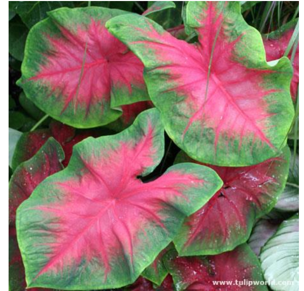
Postman Joyner Caladium

Colorblast portulaca- the new standard for drought tolerant color. From the vivaciously colored single mixes to the explosive fully doubles, to the industry changing stripes, the colorblast line is bringing a lot of excitement to garden beds and borders for its low maintenance summertime color. They perform best in full sun. They will not bloom as well if in too much shade. Plants about 12" apart. Plants can grow to approximately 6" tall and spread 16-20" wide.