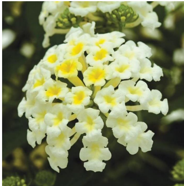
Bandana White Lantana