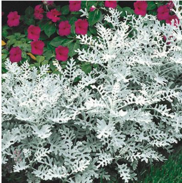
Dusty Miller Silverdust