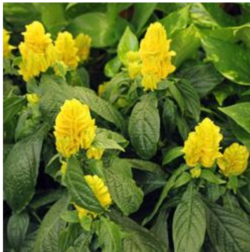
Golden Shrimp Plant