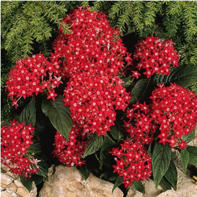
Graffiti Bright Red Penta