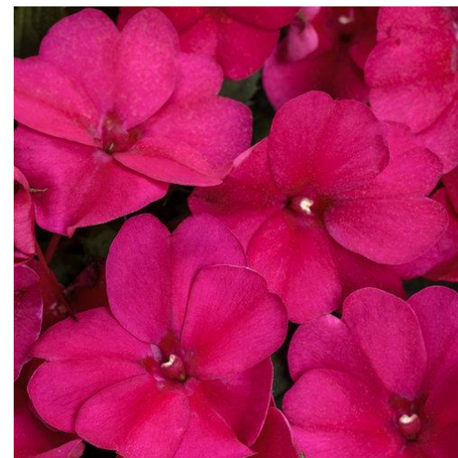
Royal Magenta Compact Sunpatiens

Golden Shrimp Plant- Part sun/shade flowering annual with showy yellow and white blooms. Use in landscape beds, works well planted in large groupings, or in containers.