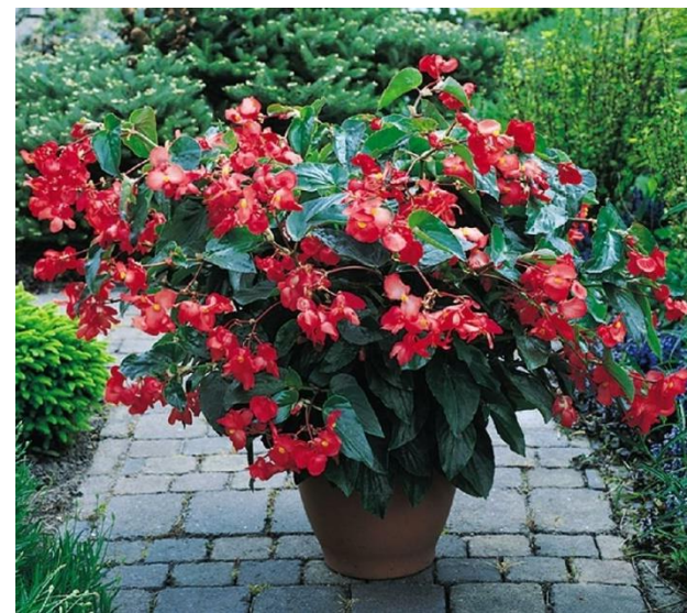
Begonia Dragonwing Red

Angelonia- Plant in Sun (at least 6 hrs of sun) Space 10-12" apart. Grows 12-14" tall by 10-12" wide. Huge flowers are vibrant against glossy dark green foliage. Thrives in extreme heat, humidity, and drought. Excellent landscape performance. Plant in full sun. Very heat tolerant and accepting of a wide range of soil conditions. Hardy until frost.