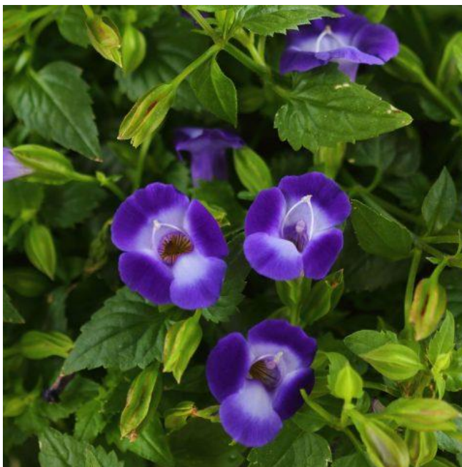
Bouquet Deep Blue Torenia