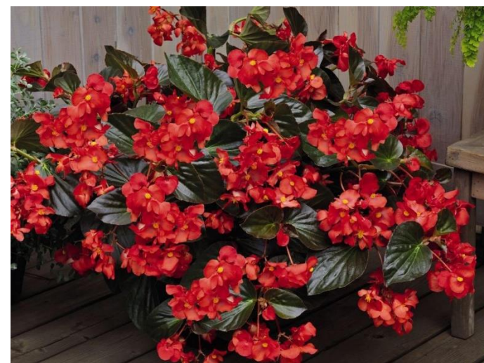
Big Whopper Bronze Leaf Begonia Series

Vista Petunia- This sun loving, cascading/ spreading petunia features medium pink blooms, spring to fall. Feed often for best results. No deadheading required! Mature size is up to 24" tall and wide, great in ground and in planters!