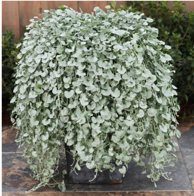
Silver Falls Dichondra

Sun/ part sun, low maintenance, silver foliage plant for hanging baskets, containers, and landscape beds. Trailing or spreading habit.