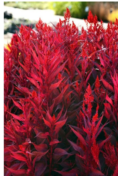
Dragon Breath Celosia

Cuphea- Abundant orange- red flowers all season, loves hot sunny spaces. Loved by hummingbirds. Drought tolerant. Grows up to 28" tall, 24" wide.