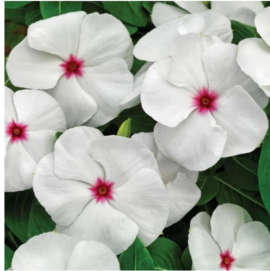
Vinca Cora Cascade Polka Dot