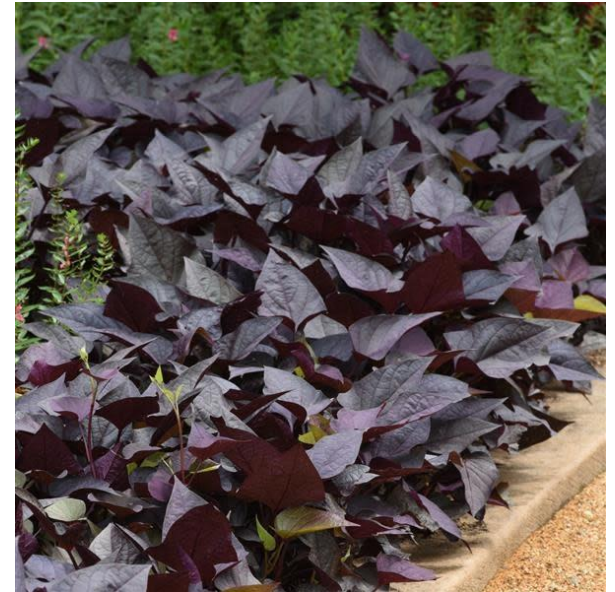
Solar Power Black Heart Ipomea

Persian Shield- Part sun/ sun annual with showy iridescent purple foliage. Drought and heat tolerant. Mass plant or use as accent. Striking when planted with Shrimp Plant. Spacing 18-24".