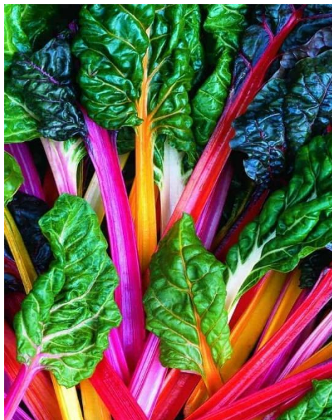
Bright Lights Swiss Chard