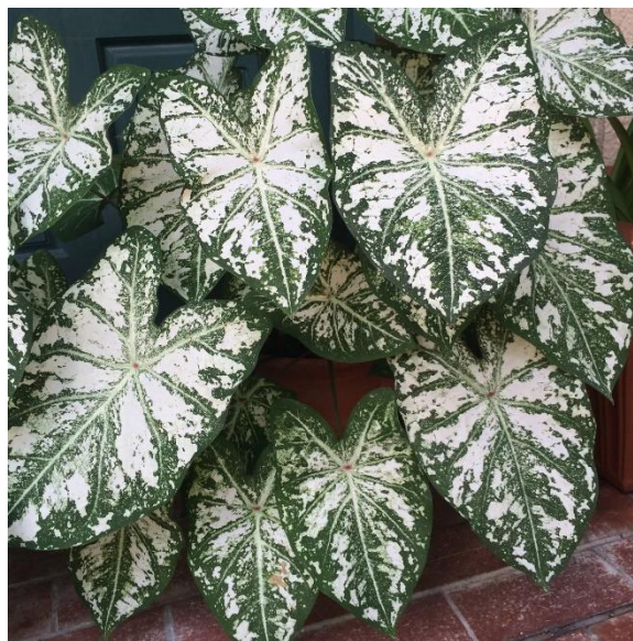
White Christmas Caladium