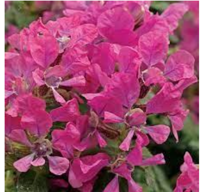
Sriracha Pink Cuphea

Graffiti- Big, bright clusters of star shaped flowers cover this compact Penta! Ideal in hot, sunny spots, these pentas attract both hummingbirds and butterflies. Mature size is 8-12" tall and wide, great for gardens and planters!