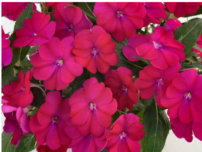
Rose Pink Nature Series Pansy