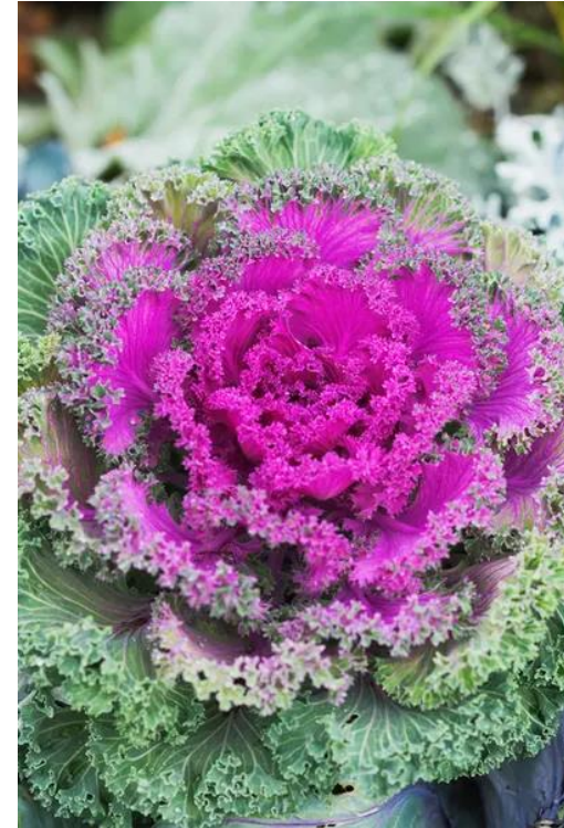
Kale Osaka Series

Dusty Miller Silverdust- Plants can get 3 feet tall and 24 inches wide. Plant in full sun with well drained compost. They pair well with flowering plants in pots and beds.