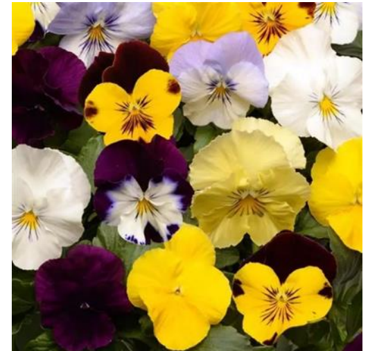
Cool Wave Mix

Cool wave pansies have a spreading and trailing growth habit which are great for pots. Minimum of 6 hours of sun for optimum growth and blooming. Plant 3 cool wave pansies for a 10 or 12" pot. These pansies will perform well on the ground and can spread from 18 to 24" in diameter. Avoid letting plants wilt and do not let plants freeze in dry soil. If temperatures are expecting to drop below freezing be sure they have moisture 24 hours before low temperatures.