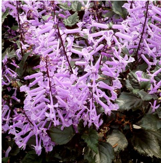
Velvet Elvis Plectranthus