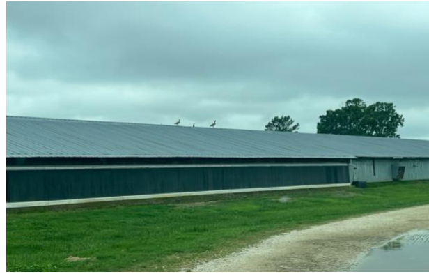
2: A couple of unwanted guests like these geese, could mean big trouble for poultry farms

Typically, warmer weather slows down the spread of Highly Pathogenic Avian Influenza, but so far this has not been the case. In the last 30 days there have been 11 confirmed cases, 9 commercial flocks and 2 backyard flocks, totaling almost 6 million birds. Be ever vigilant with your biosecurity practices, and if you see something say something or get help, as Dr. Dustan Clark would say.