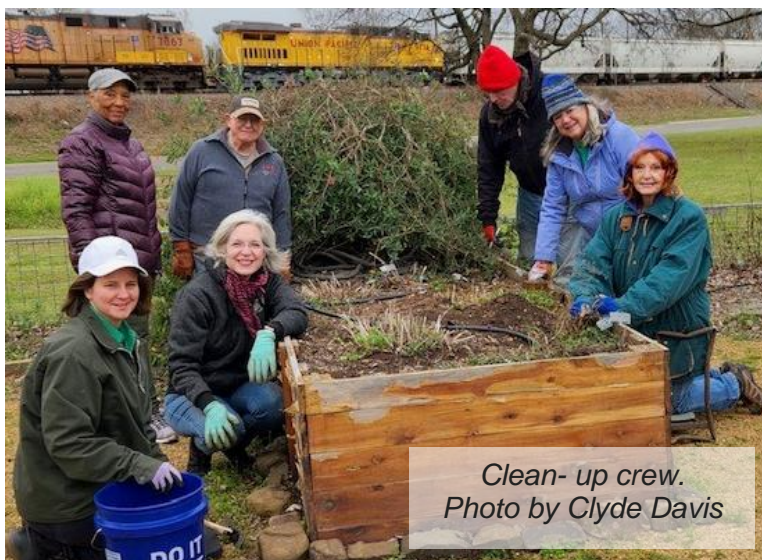
Clean- up crew.