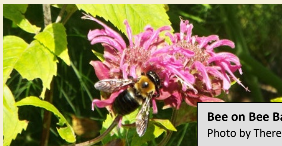
Bee on Bee Balm