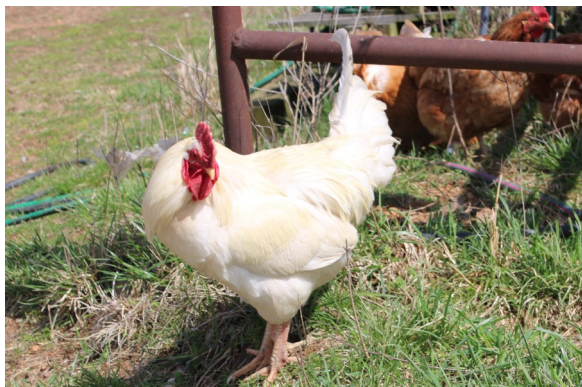
Color Living—Eden O.