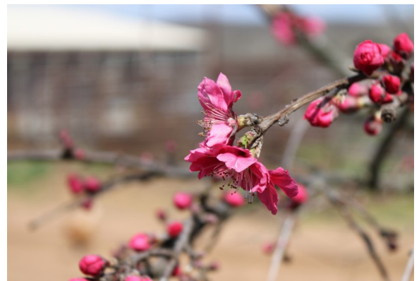
Color Non-Living—Elijah O.