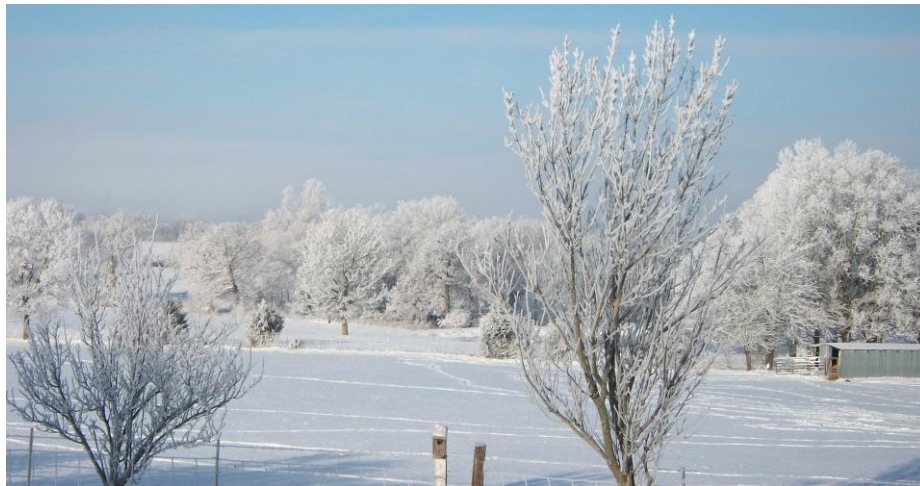
Results of fog and below freezing temperatures – “hoarfrost”

The March 8 th meeting will be held in St. Anne's Catholic Church Fellowship Hall in Berryville at 10:00 a.m.