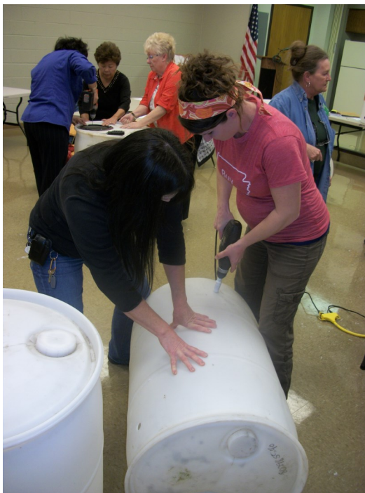
Rain Barrel Workshop

The Arkansas Cooperative Extension Service offers its programs to all eligible persons regardless of race, color, national origin, religion, gender, age, disability, marital or veteran status, or any other legally protected status, and is an Affirmative Action/Equal Opportunity Employer.