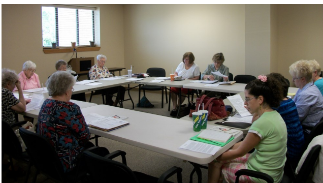
Executive Board Planning Meeting

ANYONE—regardless of race, color, national origin, religion, gender, age, disability, marital or veteran status, or any legally protected status — who wants to know timely information about individual, family, or community life.