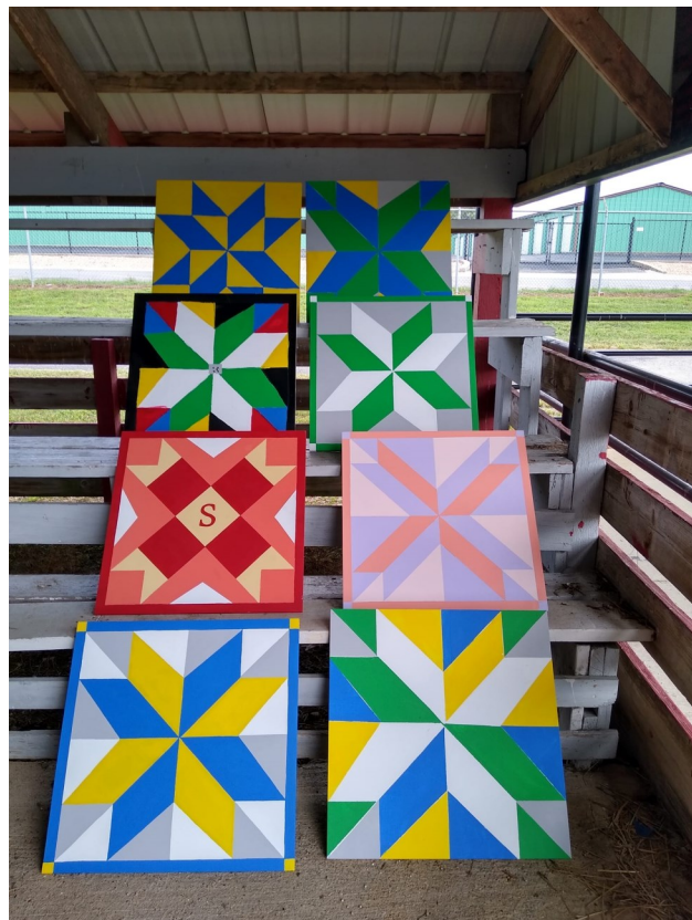
Barn Quilts made by 4-H members during this years workshop